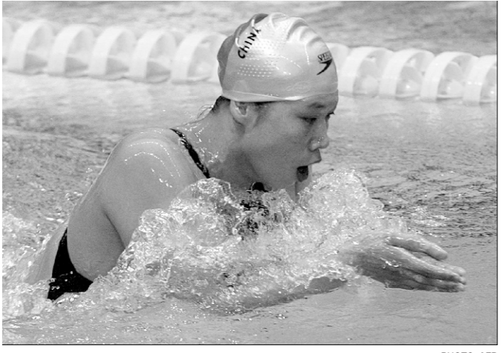
Chinese Qi Hui in action on her way to win the women's 200m breaststroke gold at the 14th Asian Games yesterday.

ageing limbs couldn't respond as they used to. Her 4:07.23 was enough to beat Chen's Asiad record but not the Chinese star's Asian record of 4:05.00.