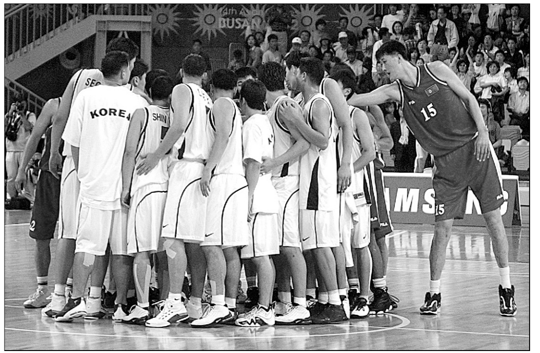
A SYMBOL OF REUNIFICATION: Cagers from North and South Korea mingle together in a circle on the centre of the basketball court at the end of their match at the 14th Asian Games yesterday.

Sri Lankans occupy the top positions for batting and bowling in the world one-day ratings for the first time ever after the hosts reached the final of the ICC Champions Trophy in Colombo. Off-spinner Muttiah Muralitharan held on to top place in the bowling ahead of Australian Glenn McGrath, while the in-form Sanath Jayasuriya moved ahead of Sachin Tendulkar to claim the number one spot in the batting standings for the first time.