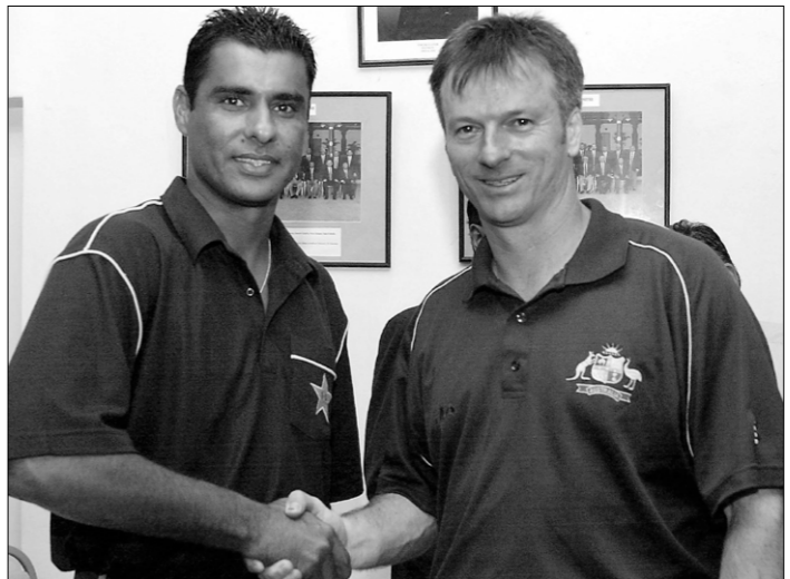
FRIENDS TODAY, FOES TOMORROW: Rival captains Waqar Younis of Pakistan (L) and Steve Waugh of Australia shake hands during a press conference in Colombo on October 1.