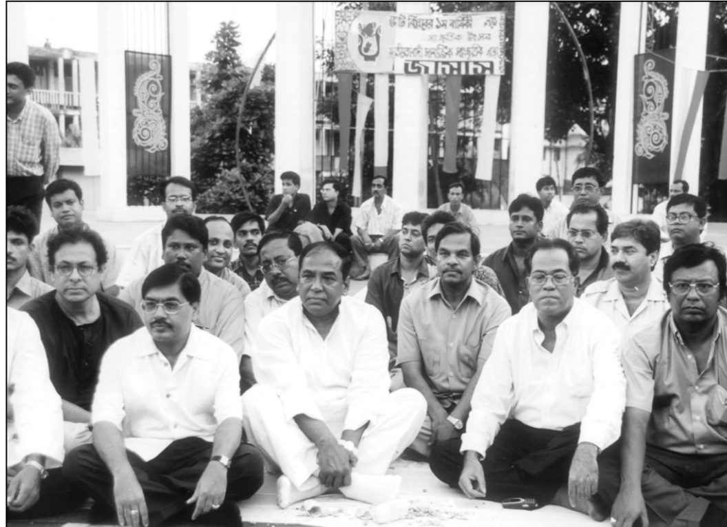
Participants at a function marking the first anniversary of the BNP 'ballot revolution', organised by the Jatiyatabadi Samajik Sanskritik Sangstha at the Central Shaheed Minar yesterday.

Even some ruling party MPs fear that they may well be on the hit list and have asked the ministers to take drastic measures to arrest the downside in the law and order in the capital.