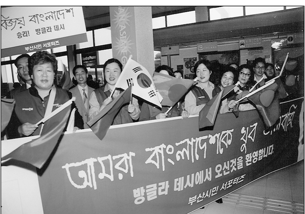
WE LOVE SOUTH KOREA TOO: A section of South Korean supporters show their affection for Bangladesh at a venue of the 14th Asian Games in Busan yesterday.

FROM PAGE 13 Innings against Bangladesh in their limited-overs practice match at the Soweto Cricket Club ground on Tuesday.