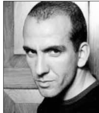
PAOLO DI CANIO

"Rest is probably the only cure for this problem - but there is no way I am going to rest at the moment, especially at a time when the team needs me to be a leader."