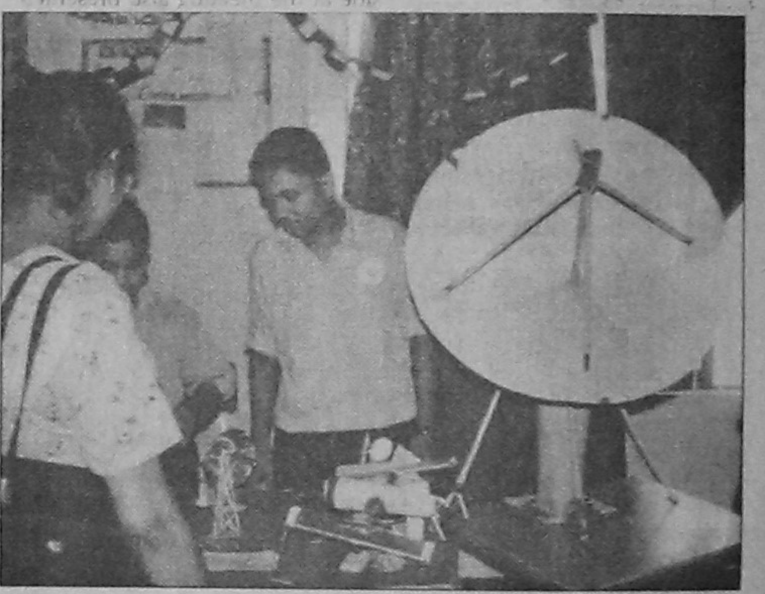
The students and teachers of the junior section of the Aga Khan School organised a science fair on the school premises in the city on Sunday.

Government of the People's Republic of Bangladesh Office of the Executive Engineer Local Government Engineering Directorate Chanmari, Narayanganj Memo No LGED/EE/N/ganj/T-01/2002/2821 Dated: 22.9.2002