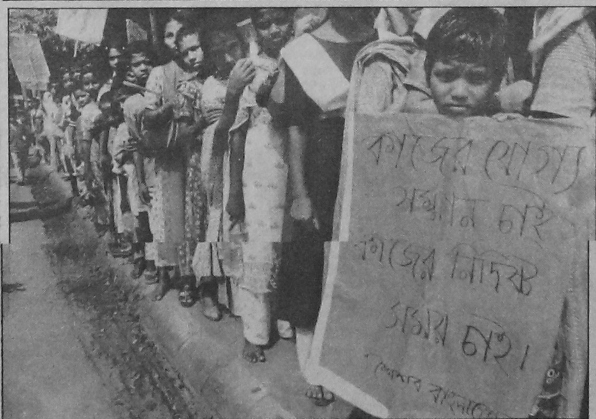
The Shaishab Bangladesh organised a procession of children who work as domestic help in the city yesterday on the occasion of Children's Rights Week.