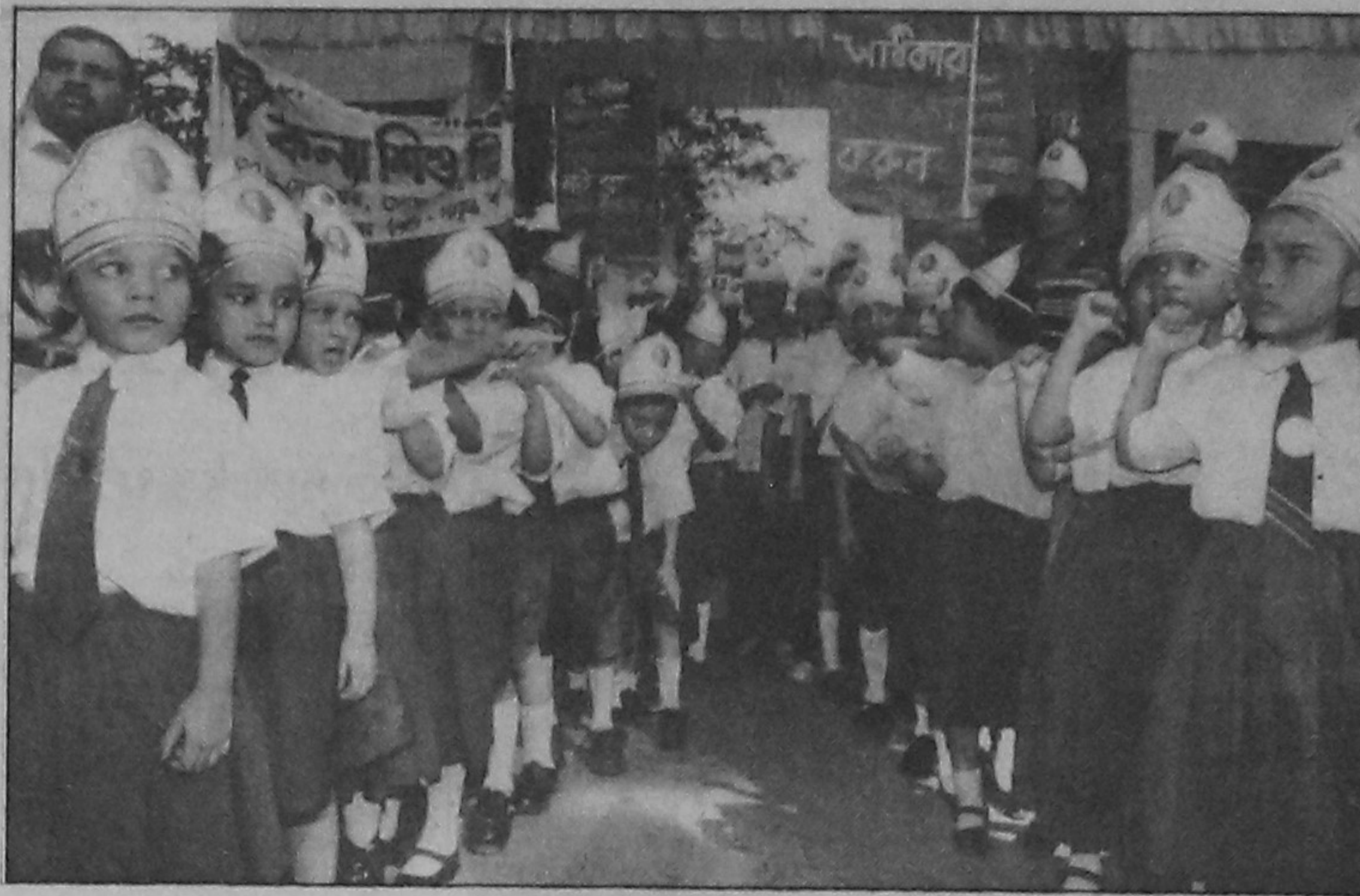
A colourful procession marking the Girl Child Day in the city yesterday.