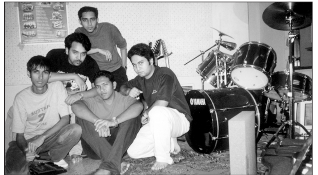
Members of Canopy

A couple of 'big' concerts of Canopy during the recent past include one at the Army Stadium last December, a charity for an ill Sohel Rana, besides performance at the auditorium of the Russian Cultural Center in the city. "Nirob-ey" (In silence) and "Bangladesh" are two of the more crowd-pulling numbers of Canopy, as informed by the members.