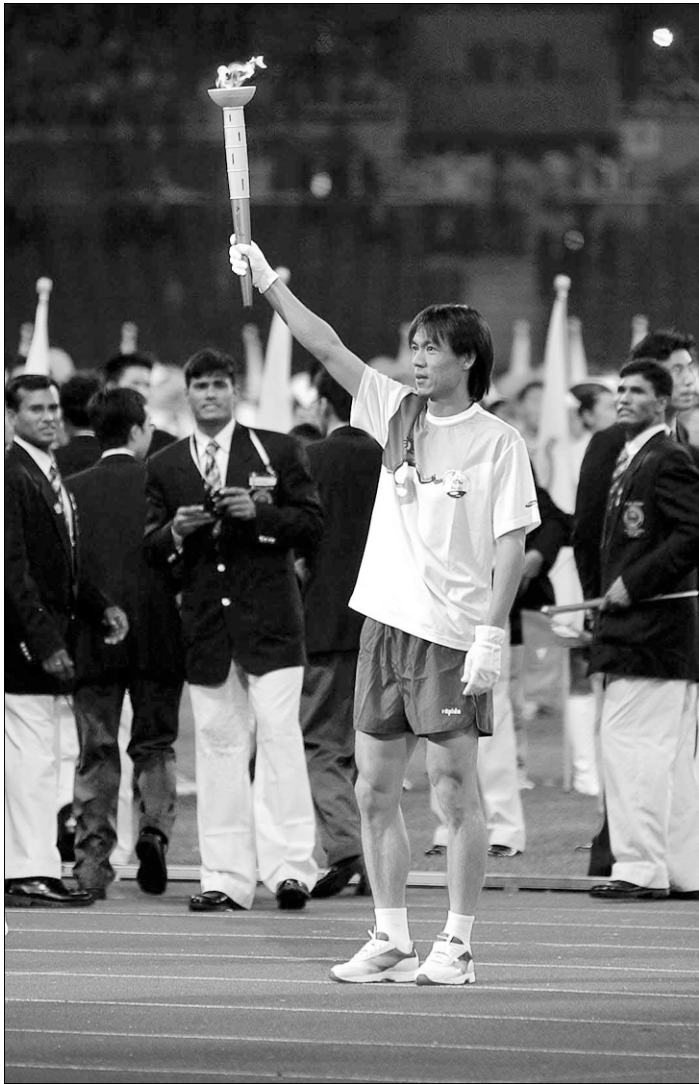
South Korea's now-retired 2002 World Cup football captain Hong Myung-Bo holds the 14th Asian Games flame with the Bangladesh contingent in the background during the opening ceremony at Busan Stadium yesterday.