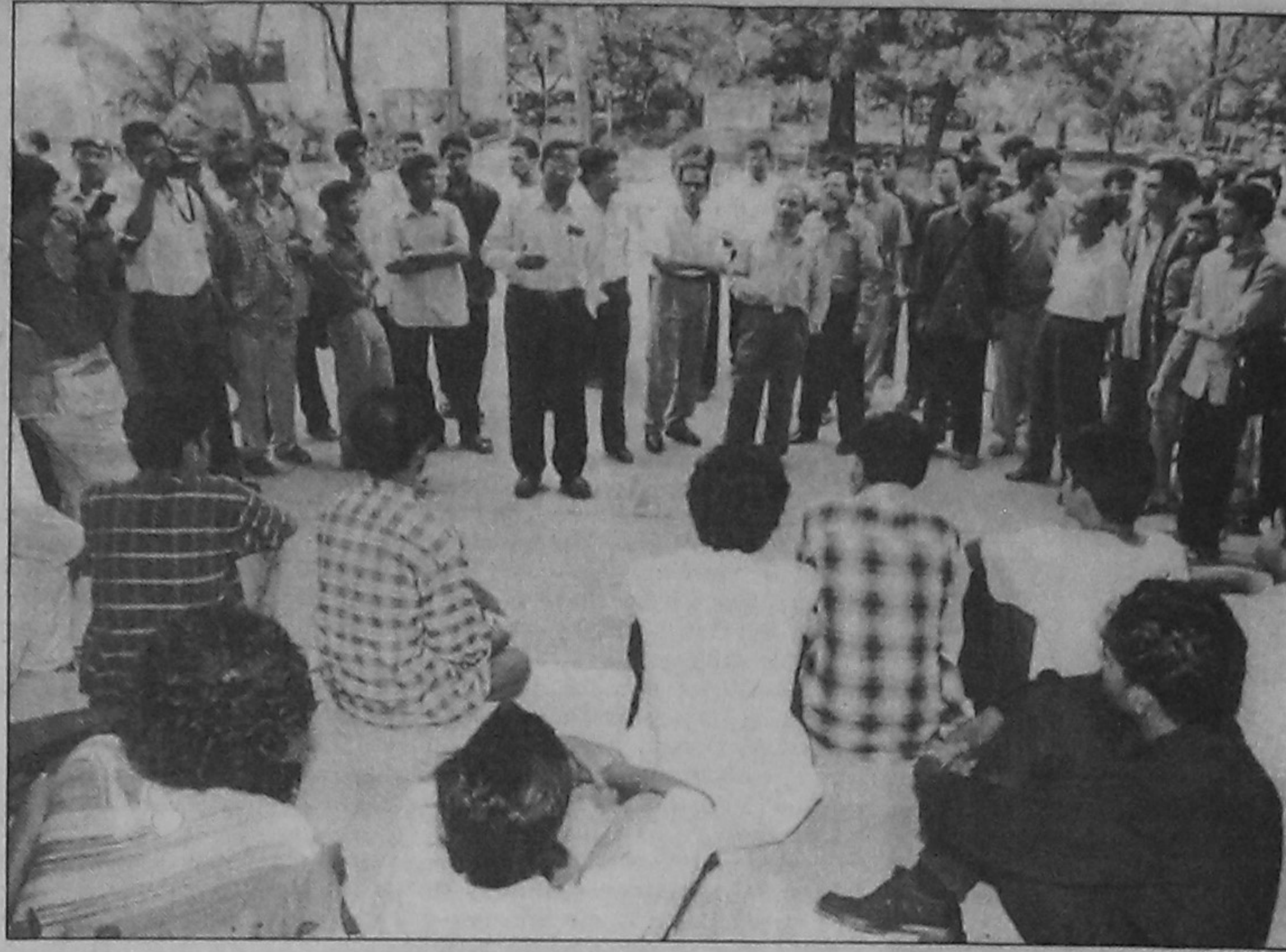
As a group of students began a sit-in on the Bangladesh University of Engineering and Technology (BUET) campus yesterday, some teachers called upon them to withdraw their programme.

Bangla Academy organises a discussion meeting in memory of Abdul Karim Sahityabharat with State Minister for Cultural Affairs Begum Selima Rahman as chief guest. Venue: Seminar room of the academy. Time: 11.00am.