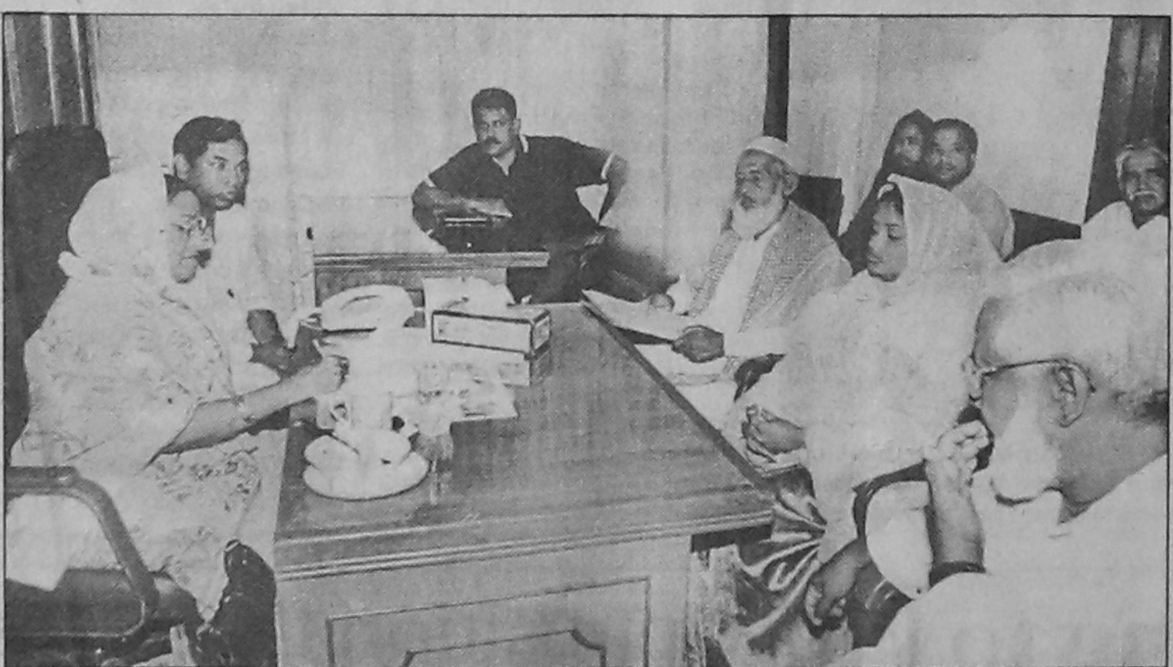
Family members of some Awami League Keraniganj thana leaders and activists who are now in jail in connection with different cases called on Leader of the Opposition in Parliament and party president Sheikh Hasina at her Dhanmondi office in the city recently.