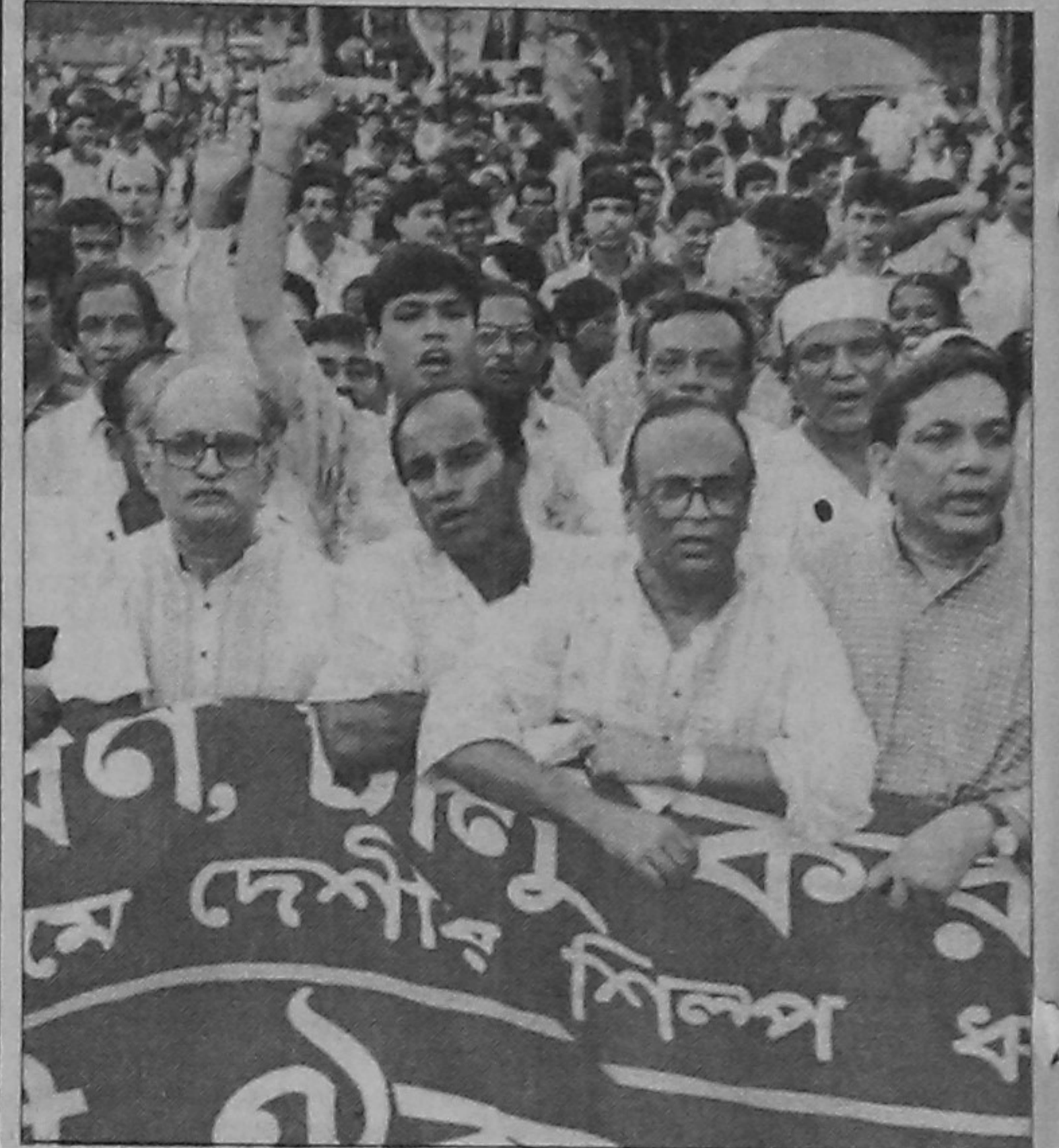
The Sramik Karmachari Oikya Parishad took to the street in the city yesterday protesting the closure of different mills and factories.