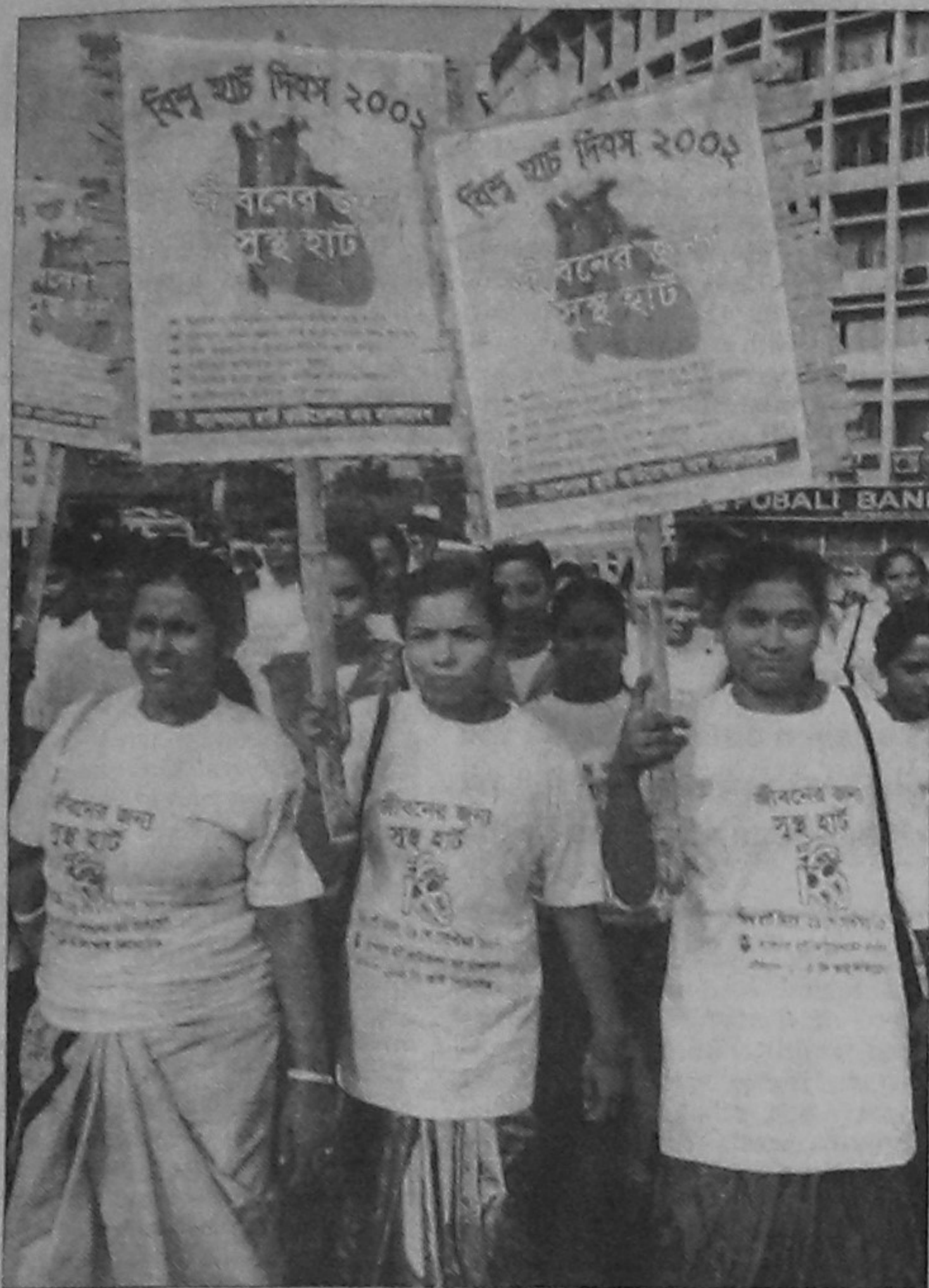
PHOTO STAR The National Heart Foundation of Bangladesh took out a procession in the city yesterday to mark the World Heart Day.