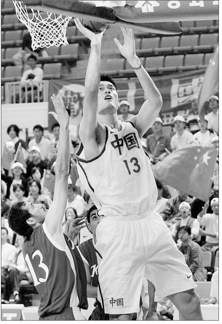
Yao Ming of China goes for a score against Kuwait during the opening game of men's basketball at the 14th Asian Games in Busan yesterday.

Wang, whose debut with Dallas in 2001 made him the NBA's first Chinese player, is in a dispute with Chinese officials and trying to secure a new NBA contract.