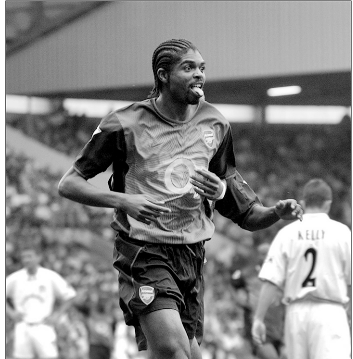
Arsenal's Kanu celebrates in unusual style after scoring against Leeds United during their Premiership clash in Leeds yesterday

And midway through the second half Terry Venables side almost got a foothold in the game when England striker Alan Smith's header from Bowyer's free-kick hit the crossbar with Seaman beaten.