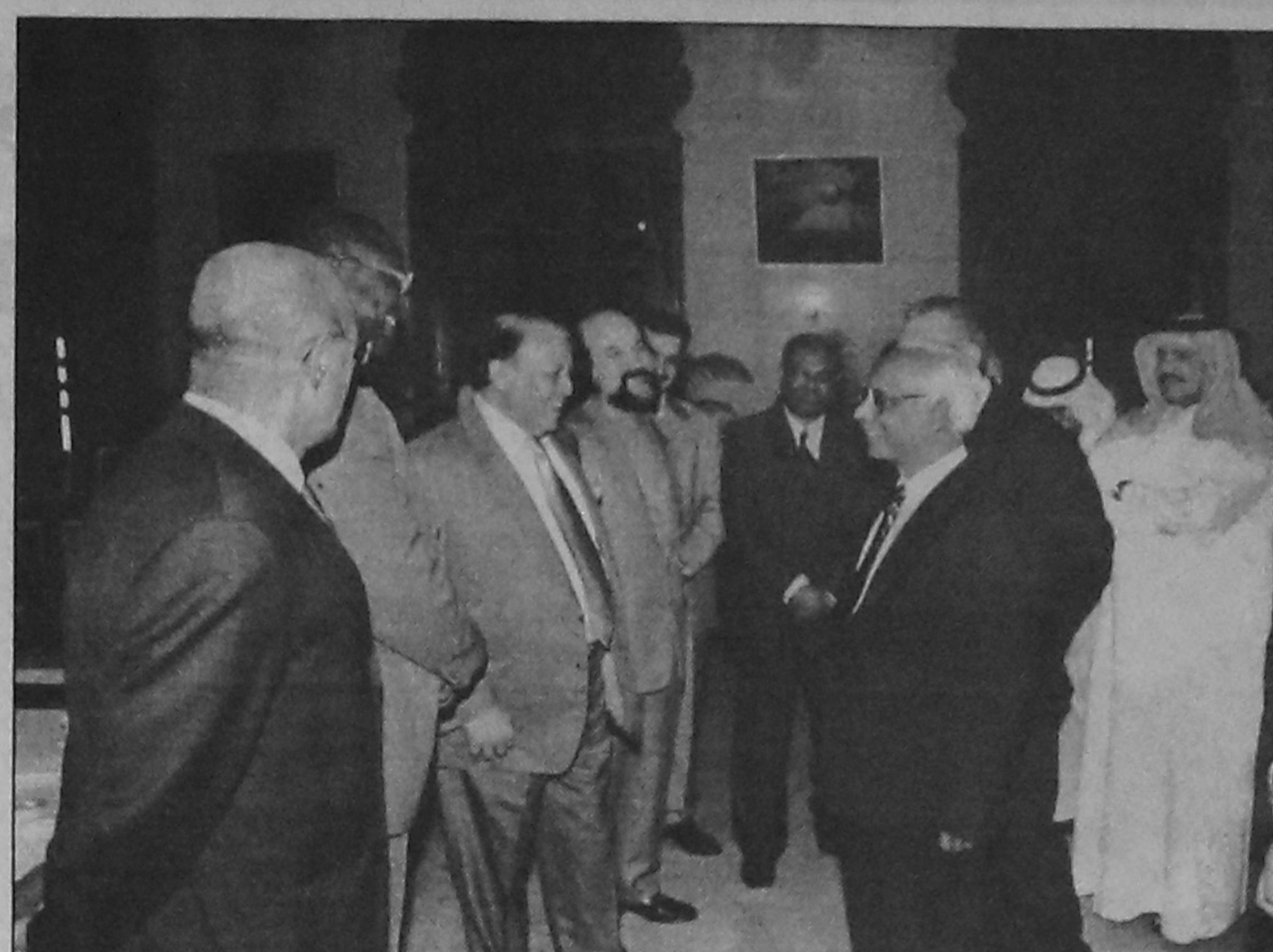
President Iajuddin Ahmed at a tea party he hosted for the diplomats of the West Asian and African countries at Bangabhaban in the city yesterday. Foreign Minister M Morshed Khan was also present on the occasion.

President Iajuddin Ahmed hosted a tea party for the diplomats of the West Asia and African countries at Bangabhaban yesterday. Ambassadors of Iran, Morocco, Palestine, Qatar, Turkey and Saudi Arabia; High Commissioner of Nigeria and Charges D' Affaires of Iraq and Libya attended the tea party. Foreign Minister M Morshed Khan and high officials of the President's office and the Ministry of Foreign Affairs were present on the occasion. President Ahmed welcomed the guests and exchanged pleasantries with them. He inquired about their welfare, said a Bangabhaban press release. Acting information secretary KM Nazmul Alam Siddiqui took charge of the office yesterday. Earlier, he served as director general of Bangladesh Television (BTV).