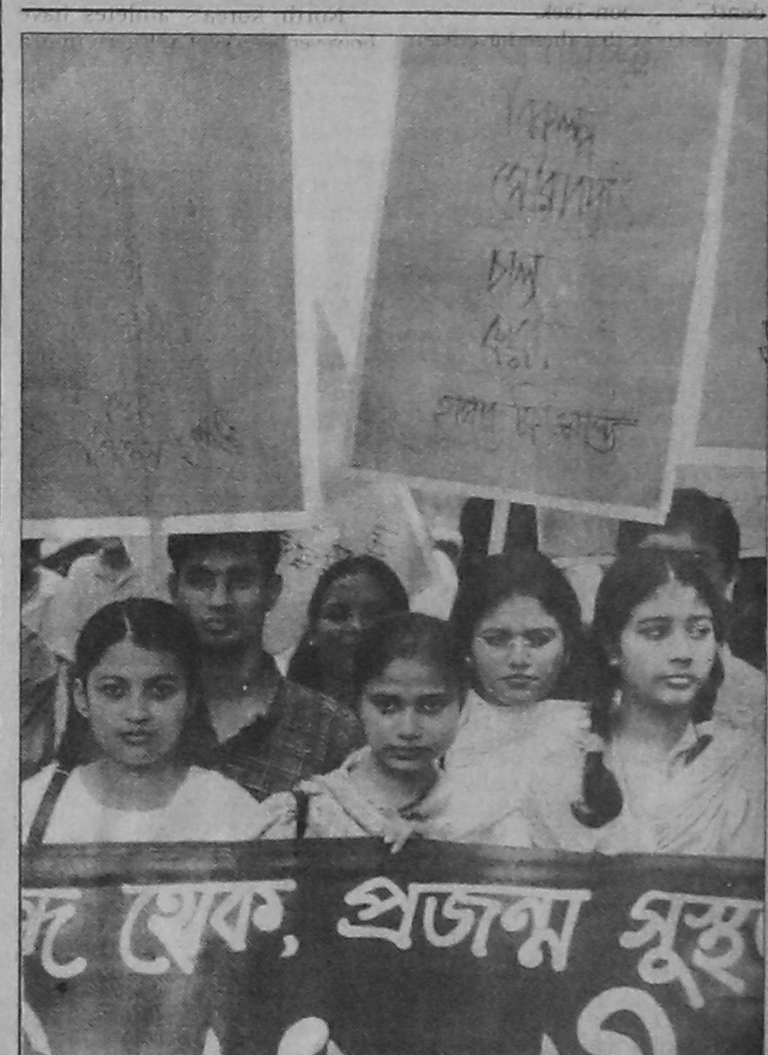
The Youth Against Hunger, the Hunger Free World and the Work for a Better Bangladesh took out a procession in the city yesterday demanding steps to contain noise pollution.