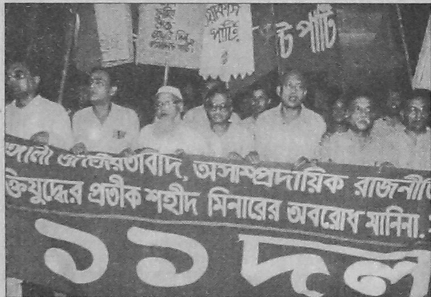
The 11-Party Alliance staged a demonstration in the city yesterday demanding withdrawal of all restrictions on rallies and demonstrations at the Central Shaheed Minar premises.