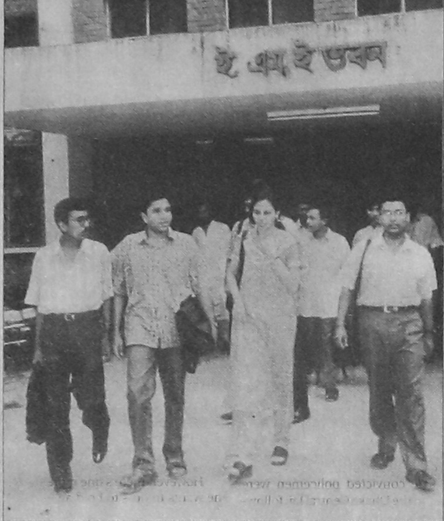
Students of the Bangladesh University of Engineering and Technology (BUET) come out of their classes. The BUET reopened yesterday after 19 days of unscheduled closure since September 8.