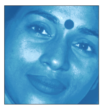
dent of Naray- anganj Institute of

Metropolitan Magistrate Mohammad Shahidul Islam of Dhaka