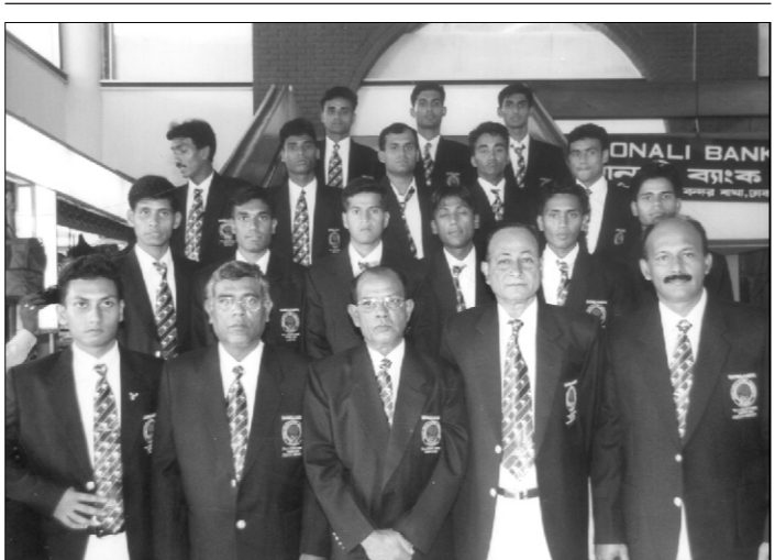
The Asian Games-bound Bangladesh hockey team.