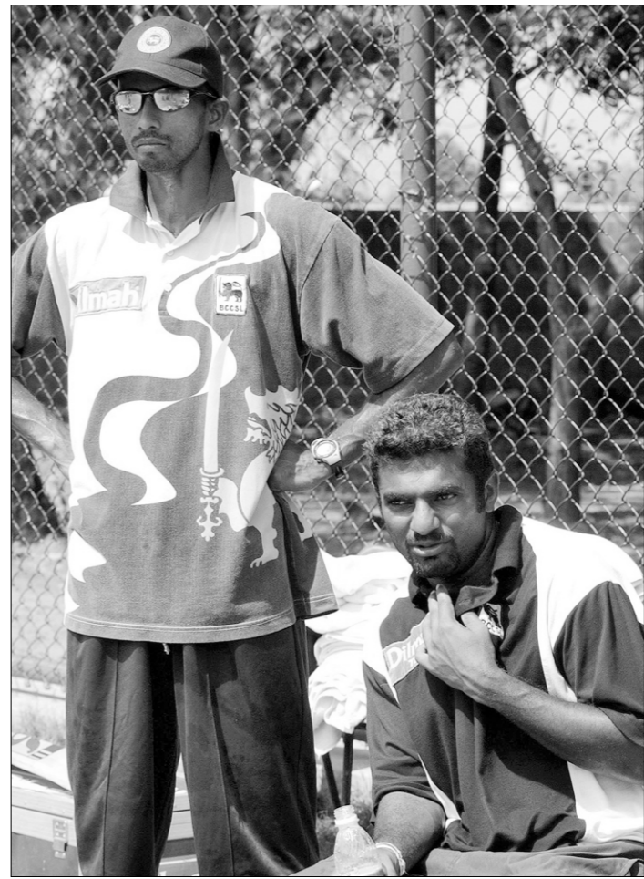
Sri Lanka's Russel Arnold (L) and Muttiah Muralitharan watch their mates practise at the Premadasa Stadium in Colombo yesterday.