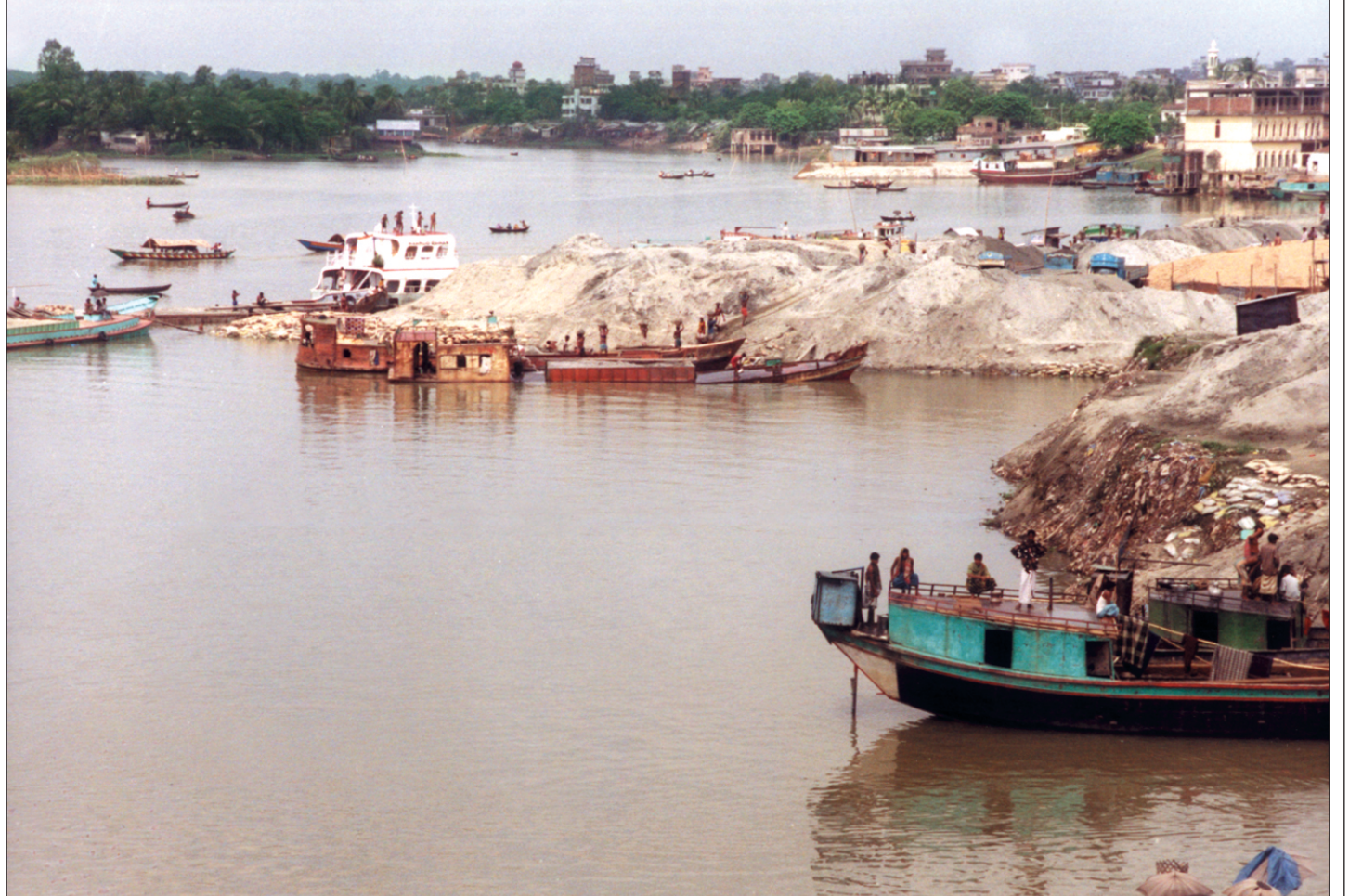
Turag taken over... unscrupulous sand traders have extended their reach deep into the river near the Amin Bazaar Bridge on the outskirts of the capital, as the