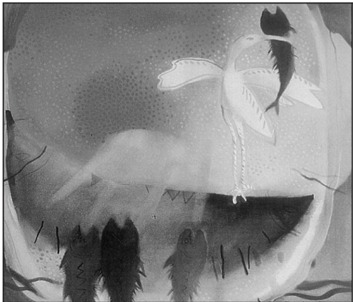
Fish and crane

want the viewers to like and enjoy my work. I don't want to be so abstract that they would be lost in confusion or contemplation. If there is something complicated the viewer may not be able to identify himself/herself with it or enjoy it to the fullest extent. Earlier I used to