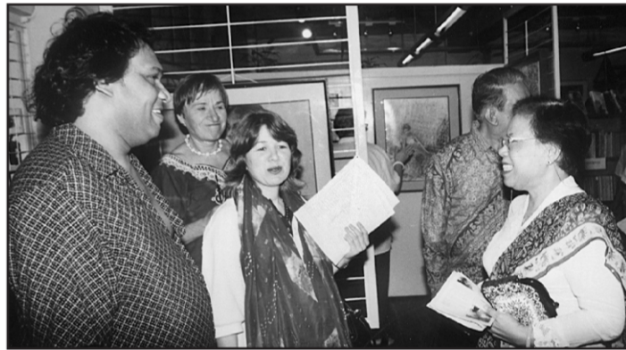
A scene from La Galerie's Revival Exhibition