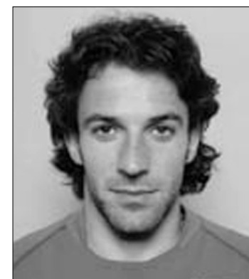
ALESSANDRO DEL PIERO

At least after two years of facing down persistent questions about his commitment, he can finally let his feet do the talking.