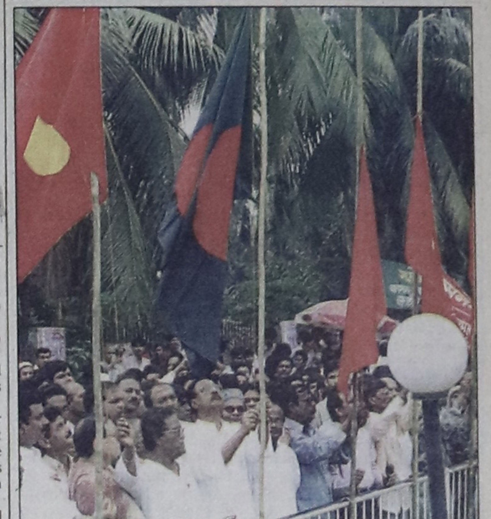
Jatiya Samajtantrik Dal (JSD) president ASM Abdur Rob inaugurating the JSD Dhaka City unit's convention 2002 at the Mahanagar Natya Mancha in the city yesterday.

Nine persons were arrested in connection with the arms recovery and police filed four cases against them under the Arms Act.