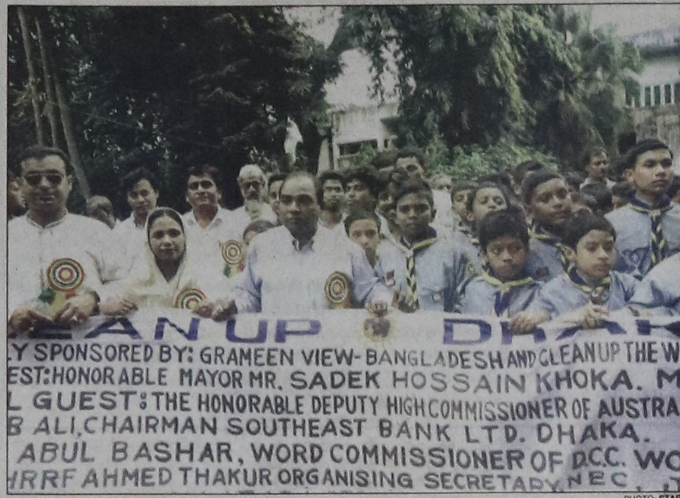
A procession paraded through the city streets yesterday urging all to keep the city clean.

The two-day workshop covered different topics including introduction to DNS, DNS security, server management, server security, ICANN (The Internet Cooperation for Assigned Names and Numbers) root server, IANA functions and multilingual DNS and ICANN.