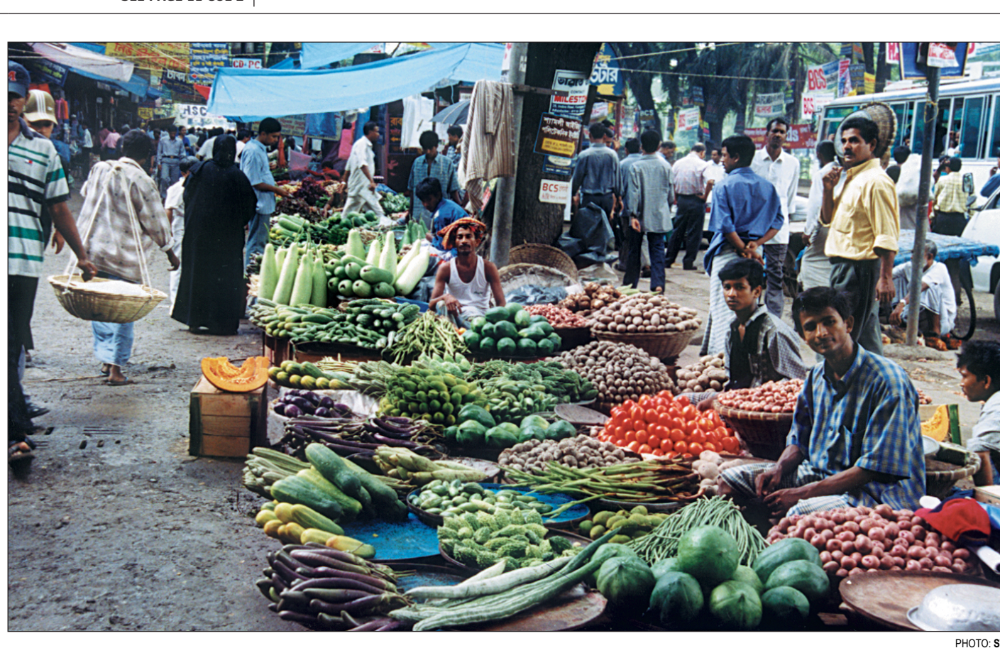
Hawkers do a brisk business on the Indira Road after it was made off-limits to rickshaws for smooth movement of pedestrians and so do police who collect money for turning a blind eye.