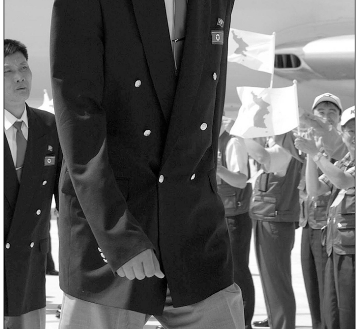
WELCOME: Ri Myung-Hun, who at 236 centimetres (seven feet eight inches feet) is the tallest basketball player in North Korea, walks into the airport terminal in southern city of Busan yesterday.

match yesterday but I never thought Safin and Kafelnikov had given "We should have finished the tie yesterday by going 3-0 up and let