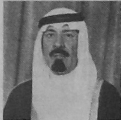
Crown Prince Abdullah Bin Abdul Aziz