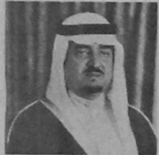
King Fahd Bin Abdul Aziz

Our heartiest felicitations and greetings to the Government, Royal Family and the Brotherly People of the Kingdom of Saudi Arabia on the auspicious occasion of their National Day