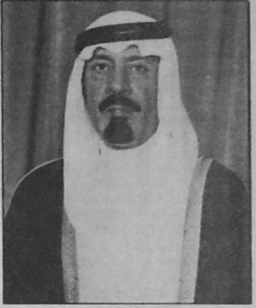
Prince Abdullah Bin Abdul Aziz, The Crown Prince and Deputy Premier and Head of the National Guard

Our heartiest felicitations and greetings to the Government, Royal Family and the Brotherly People of the Kingdom of Saudi Arabia on the auspicious occasion of their National Day