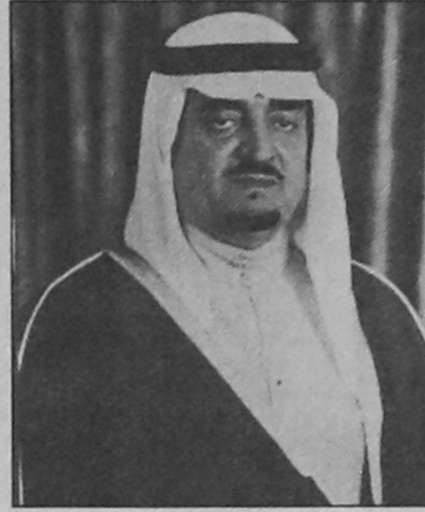
Custodian of the two Holy Mosques, King Fahd Bin Abdul Aziz

We extend our heartiest felicitations to His Highness the King Fahd Bin Abdul Aziz, the Government and the Brotherly People of Kingdom of Saudi Arabia on their glorious National Day