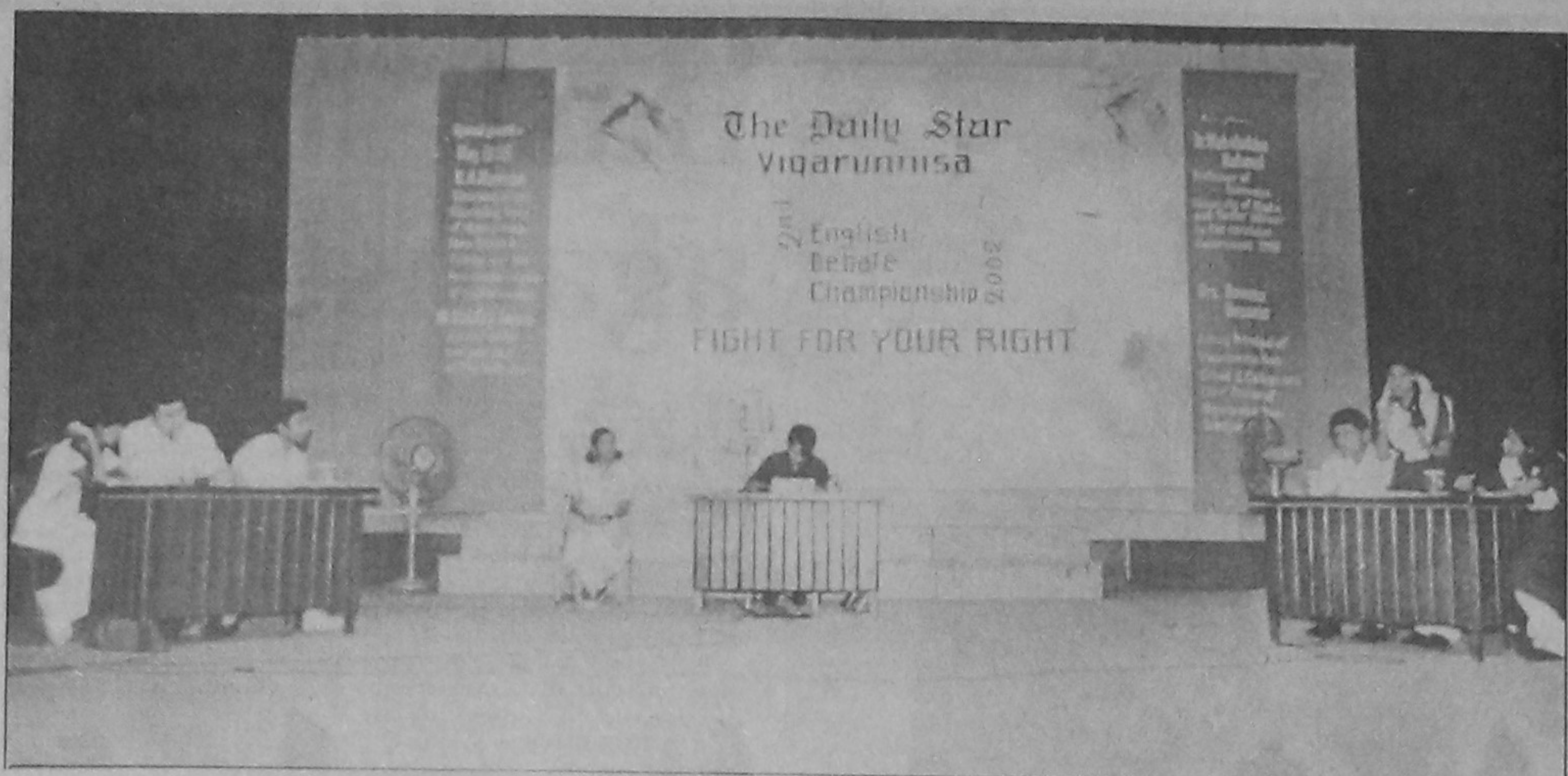
The Uttara Rajuk Model High School and the Government Laboratory High School confronted each other at 'The Daily Star-Viqarunnisa 2002 English Debate Championship 2002' at the Viqarunnisa Noon School and College auditorium in the city yesterday.

Thirteen persons were arrested in connection with the arms recovery and police lodged ten cases against them under the Arms Act.