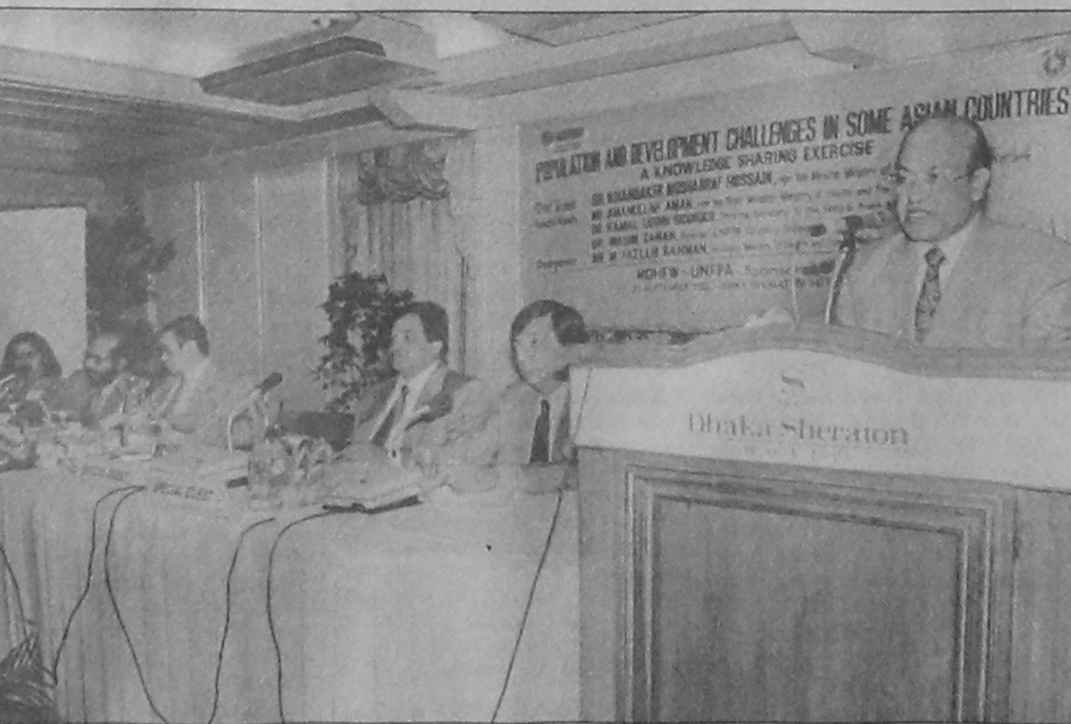
Health Minister Dr Khandaker Mosharrar Hossain speaking at the inaugural session of an international symposium on 'Population and development challenges in some Asian countries: A knowledge sharing exercise' at Sheraton Hotel in the city yesterday.

Delegates from India, Pakistan, Indonesia, Iran, Nepal, Sri Lanka and host Bangladesh are attending the sessions.