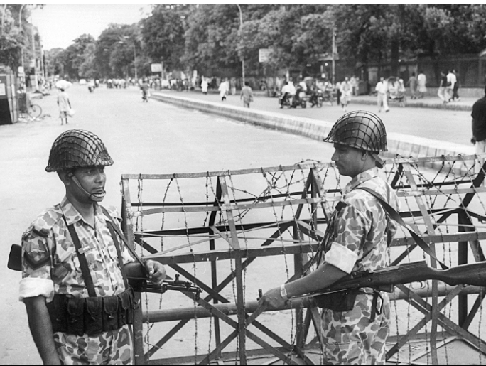
Picture: The paramilitary BDR personnel are on guard on the road leading to the Teachers and Students Centre (TSC) on Dhaka University campus

News: Around 1,000 law enforcers deployed on the Dhaka University campus on 11 September 2002 foiled a scheduled mass gathering of students