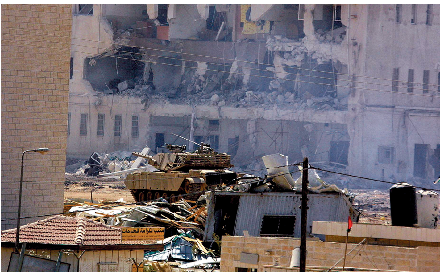
An Israeli tank takes position between destroyed buildings in Yasser Arafat's headquarters as the army blows up parts of Arafat's office building with explosives yesterday in the Ramallah. Israeli tanks were just 10 metres from Arafat's office after the army destroyed every other building in his headquarters overnight, detaining 19 of their occupants.