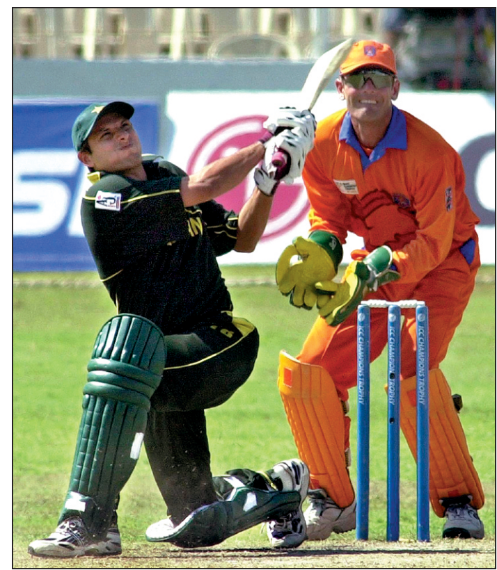
Pakistan batsman Shahid Afridi (L) hoists one for six during his quick-fire half-century against Holland in yesterday's ICC Champions Trophy match at the Sinhalese Sports Club ground in Colombo.