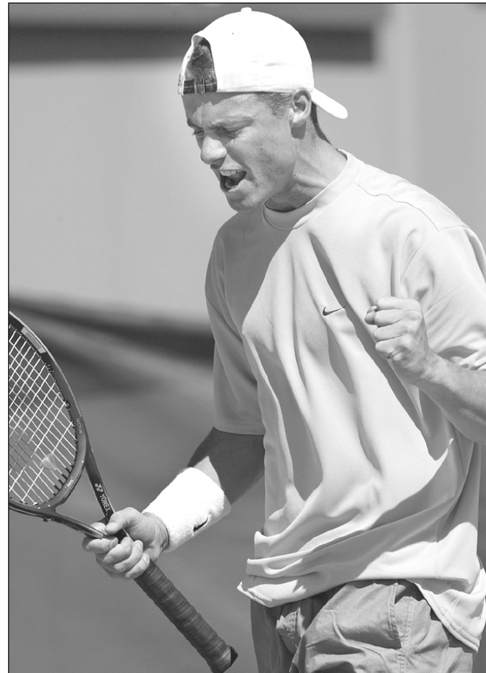
World No. 1 Lleyton Hewitt urges himself on after winning a point during his Davis Cup match against Harsh Mankad of India in Adelaide yesterday.

Australia, without semi-retired Pat Rafter and injured Mark Philippoussis, gave Arthurs another singles chance after he lost the