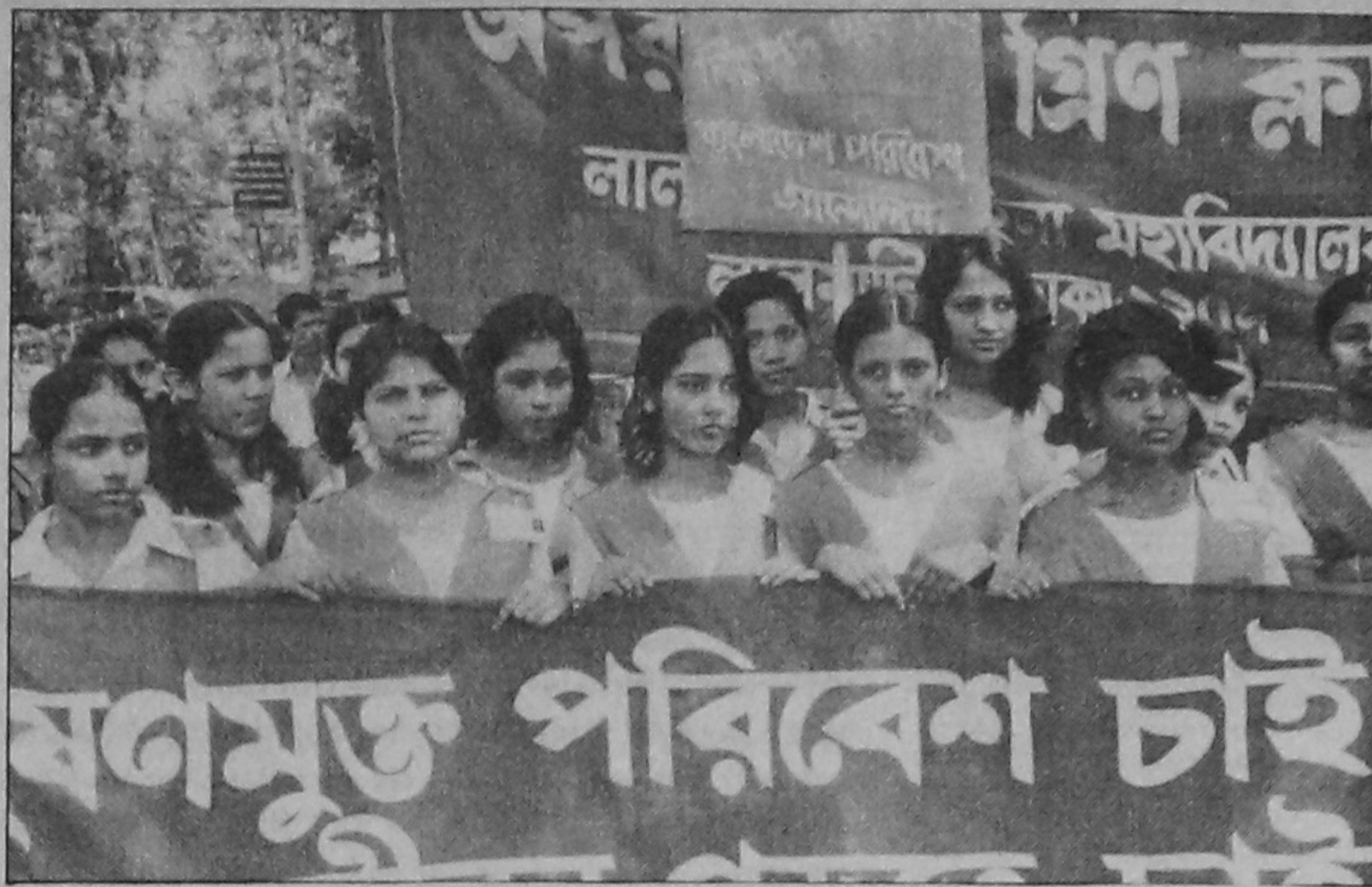
The Bangladesh Paribesh Andolan took out a procession in the city yesterday demanding steps to contain pollution.