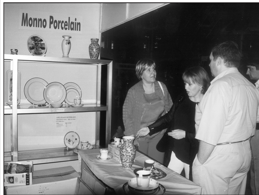
A group of foreigners at a stall in the first ever small and medium enterprise (SME) fair organised by the FBCCI at the Bangladesh-China Friendship Conference Centre at Sher-e-Bangla Nagar in the city.