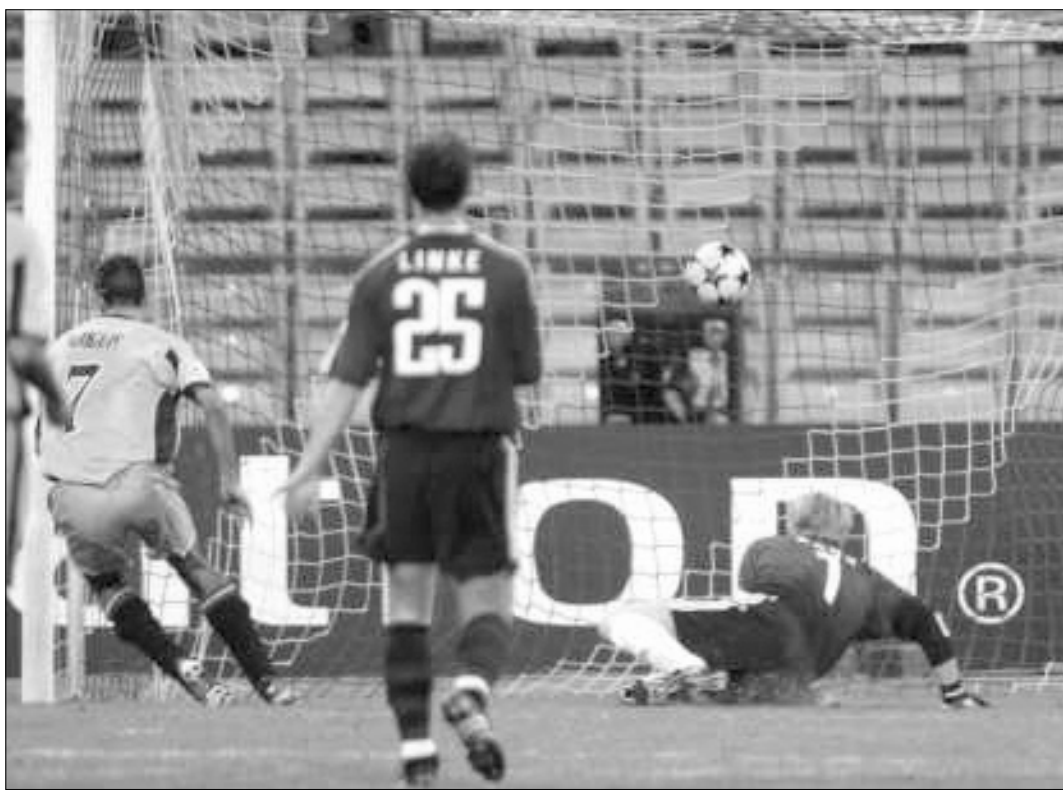
ROY IS ROYAL: Deportivo La Coruna's Dutch striker Roy Makaay (L) scores his second goal past a despairing Bayern Munich goalkeeper Oliver Kahn at the Olympic Stadium in Munich on September 18.