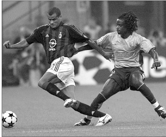
AC Milan superstar Rivaldo (L) trying to outwit RC Lens's Senegalese international Ferdinand Coly in Milan on September 18.

Rivaldo was looking fresh and dangerous on the edge of the box having played just the final 20