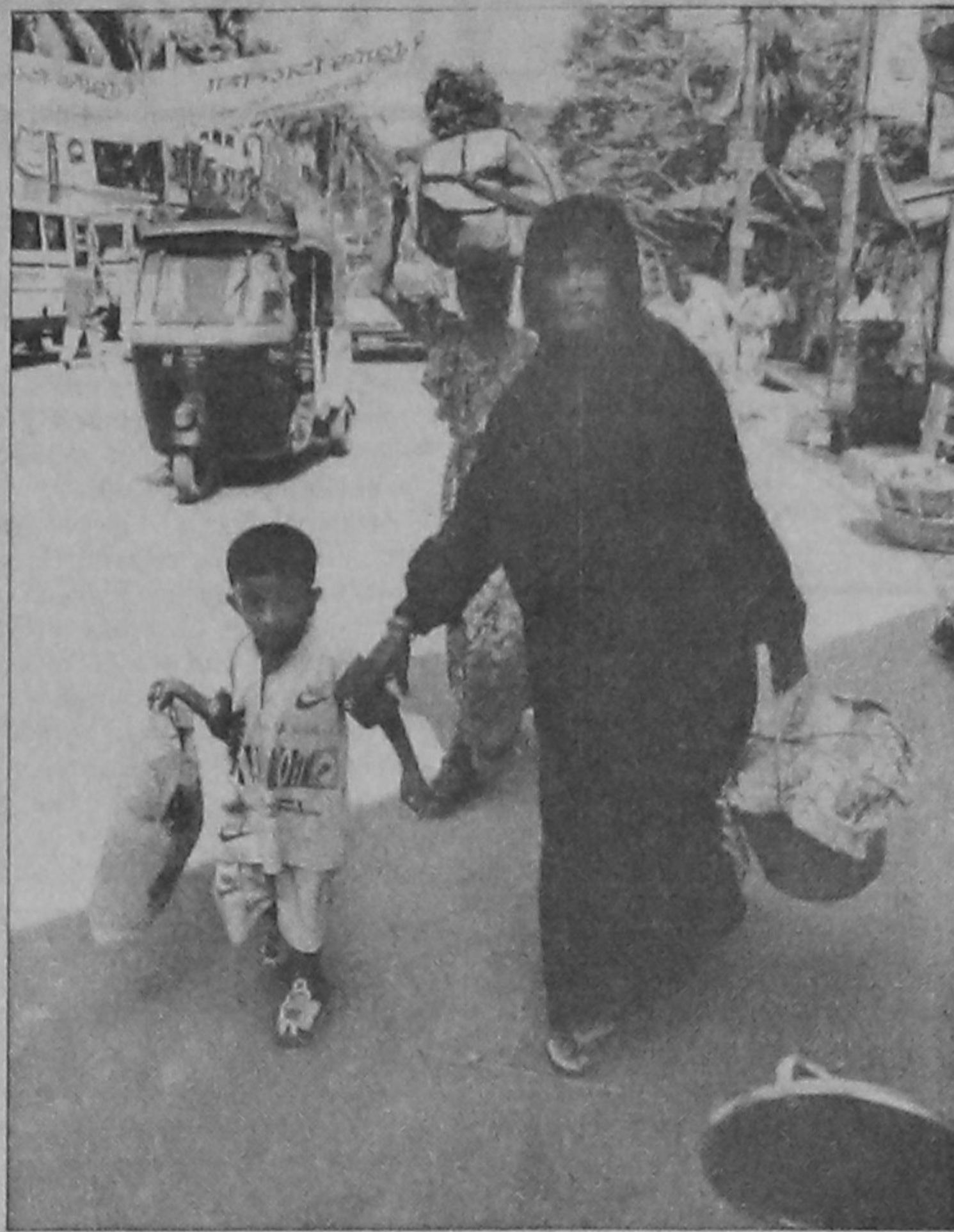
A woman along with her children walks to her destination under the scorching sun as rickshawpullers went on a strike in the city yesterday to press home their various demands.

The Regional Manager Burns Philp India Pvt. Limited 60C, Chowringhee Road, Block C2, 1st Floor Kolkata 700 020, India Tel : +91 332470530/+91 332475969/+91 332818960 Fax : +91 332801501 Email : bpca@mauri-india.com