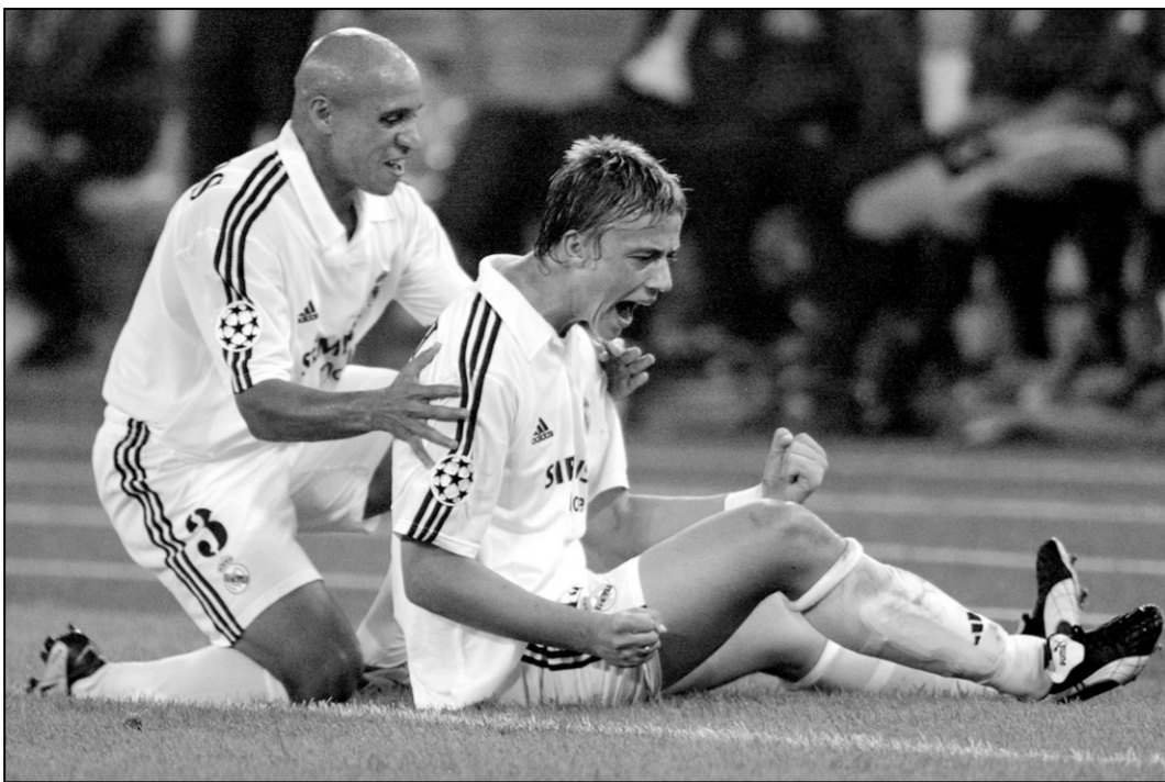
An ecstatic Real Madrid forward Guti (R) being congratulated by Roberto Carlos after scoring one of his two goals against AS Roma at Rome's Olympic Stadium on September 17.

as the sixth minute when Christian Panucci headed a corner just wide with Emerson scrambling for a potentially decisive touch at the back post.