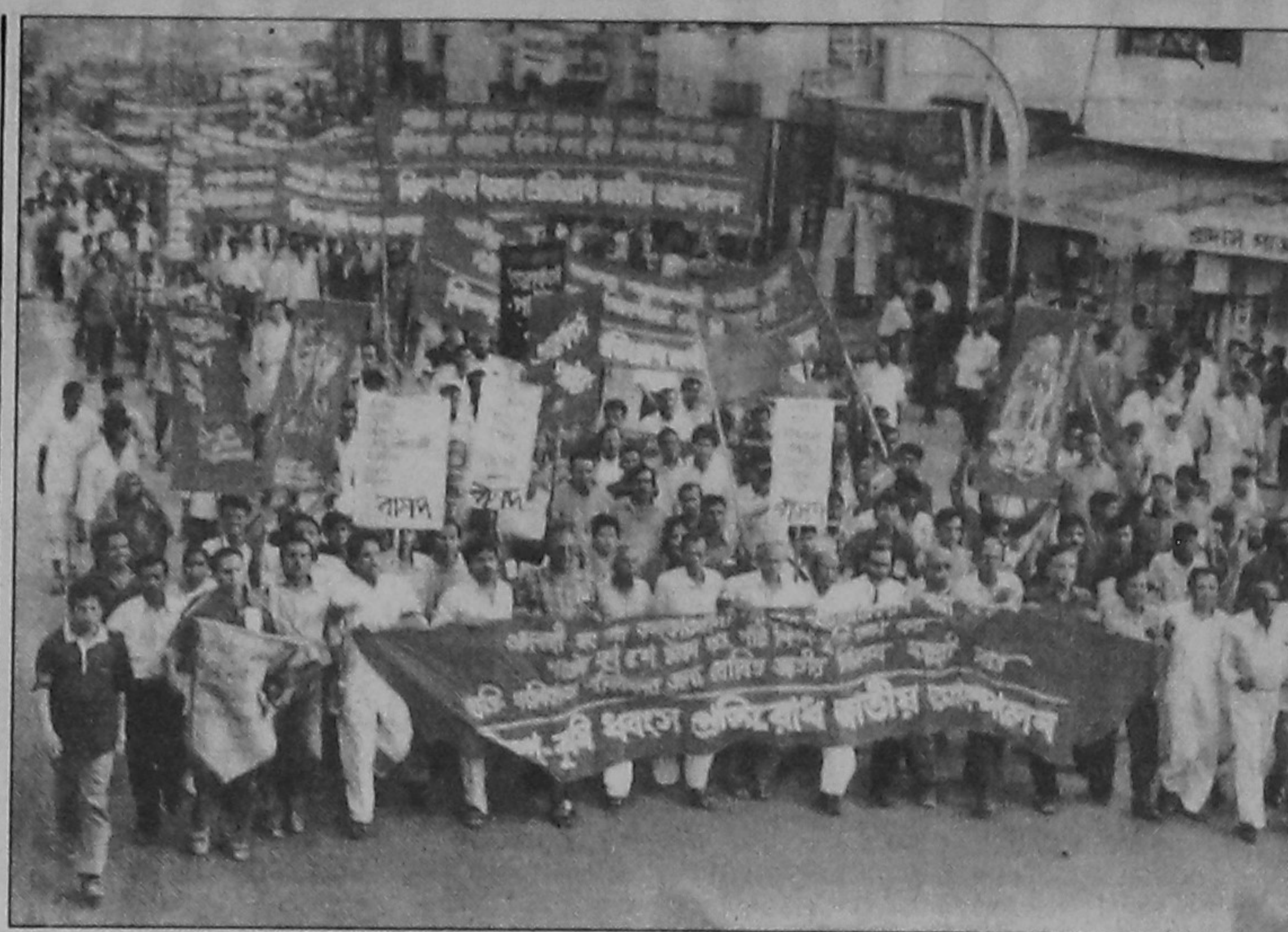
The National Movement for Resistance to Industry-Agriculture Destruction took out a procession in the city yesterday.