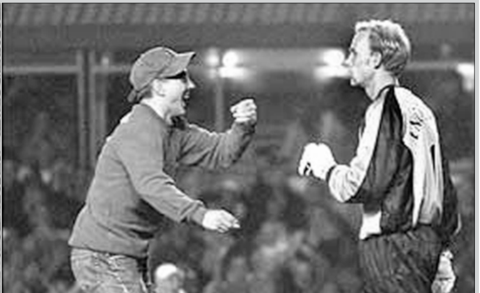
THE ENCKELMAN NIGHTMARE! (L) Aston Villa custodian Peter Enckelman appears in control as he looks to deal with Olof Mellberg's innocuous throw-in. (C) The ball however, squirms under the hapless keeper's foot and he can only watch as it rolls into the net. (R) The goal puts Birmingham 2-0 up and a fan rushes on to the pitch to rub salt on Enckelman's wounds.