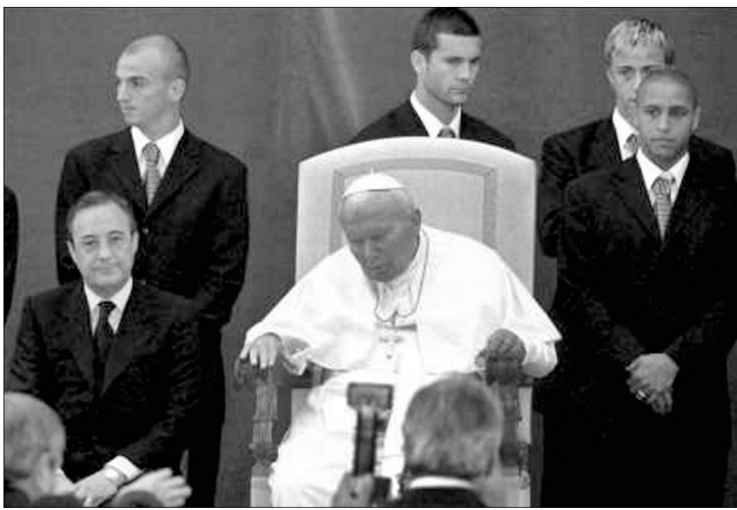
REAL GET STRONGER! Pope John Paul II sits surrounded by Real Madrid President Florentino Perez (bottom L), Argentine youngster Esteban Cambiasso (standing L) and compatriot Santiago Solari (C), Jose Maria Gutierrez (partly obscured back R) and Brazilian superstar Roberto Carlos during the team's private audience with the Pope in Castelgandolfo, Italy on September 16.

Ballack is suffering from a painful left foot injury and did not train on