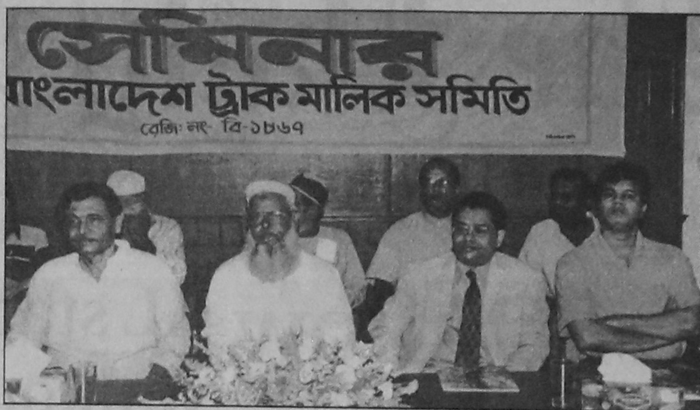
Discussants at a seminar on 'Causes of traffic jam and environment pollution and the remedies' held at the National Press Club in the city yesterday.

He died of lung cancer on this day in 1993. On the occasion milad mahfil and prayer have been arranged at his village home at Chaura Vathgati of Kaliganj Upazila in Gazipur district.