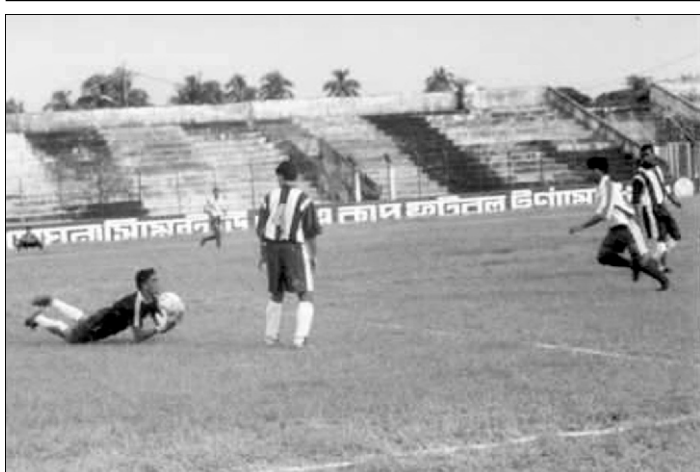
Action from yesterday's DSA Cup football league match between Hong Kong Boys Club and Quasem Smriti Sangsad at the Khulna Stadium. Quasem Smriti won the match 5-3 in tie-breaker.

Matches were held only on the Ariake Coliseum centre court on Monday with its roof closed due to steady rain.