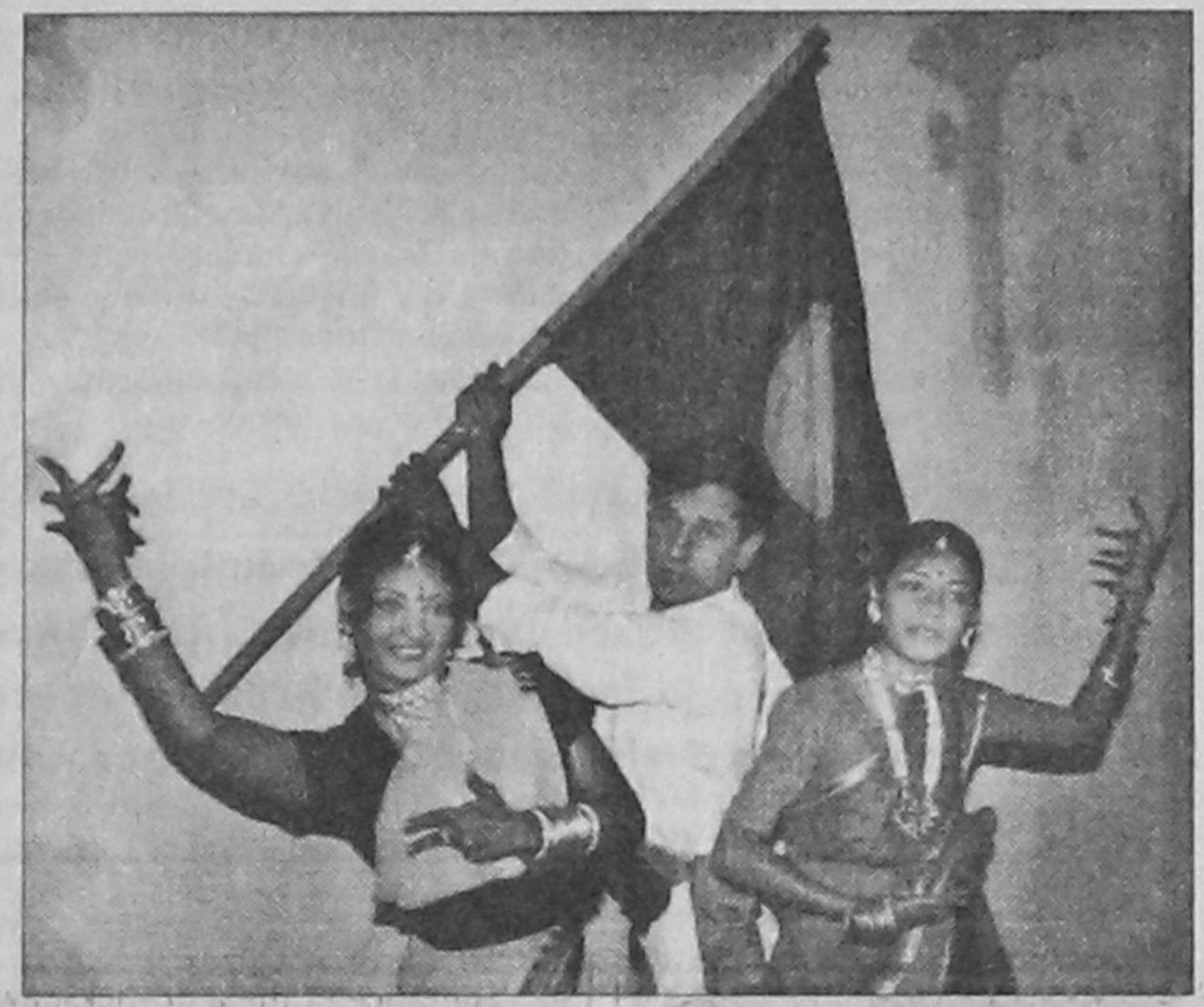
PHOTO STAR The Binodan Sangbadik Samity organised a cultural function and a seminar at the National Press Club in the city yesterday to raise awareness about dengue fever.

Prior to submission of the memorandum, the GCHTSC held a rally at Muktangan in the city at 11.00am.