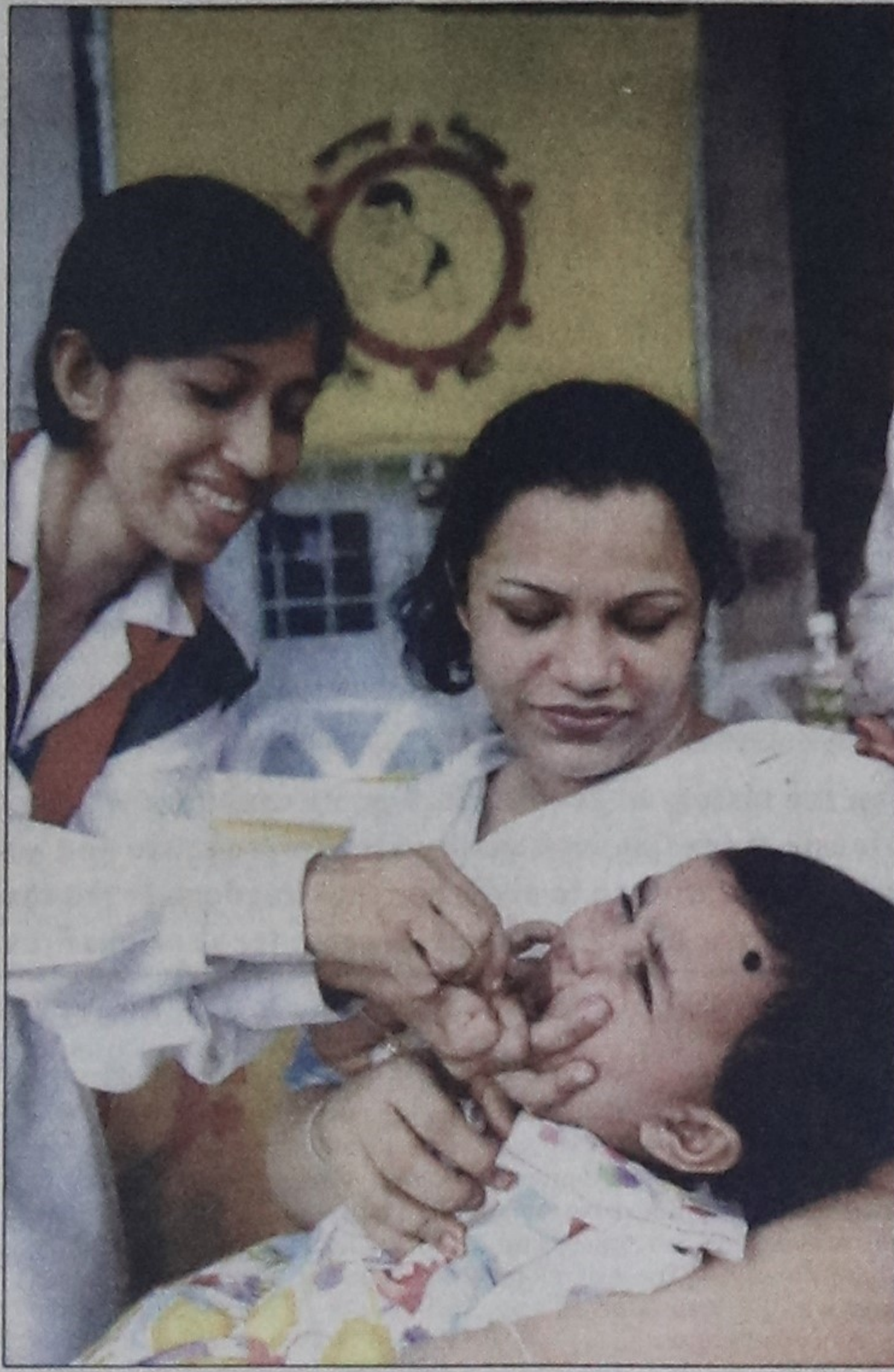
A member of Girl Guides administers polio vaccine to a child in the city as the second round of special National Immunization Day (NID) was observed across the country yesterday.

Justice Abdur Rouf stressed the need for improvement of the system of national education.