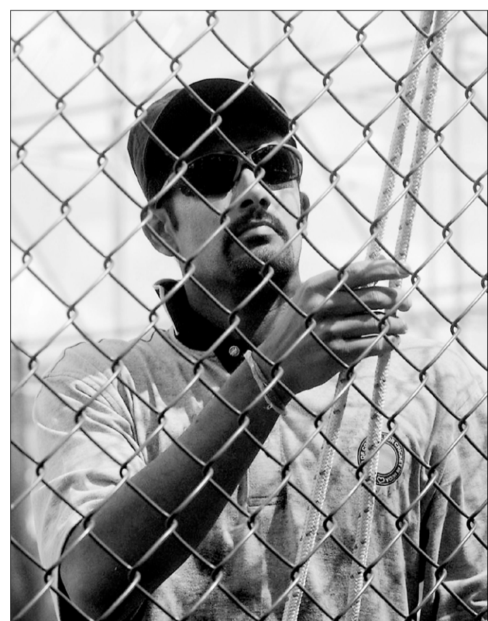
Indian leg-spinner Anil Kumble checks the net before practice at the Premadasa Stadium on September 13.