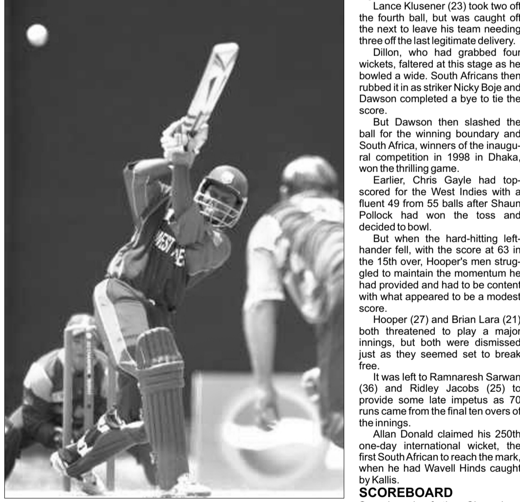
West Indies opener Shivnarine Chanderepaul goes over the top during the ICC Champions Trophy match against South Africa yesterday.

But gradually they appeared to gain control thanks to a stand of 117 between Jonty Rhodes (61) and Boeta Dippenaar (53), a record fourth wicket partnership for South Africa against the West Indies. However, when off-spinner Carl Hooper removed both men in the space of three balls in the 40th over, the picture changed and the West Indies were firmly in the driving seat with six balls remaining. Pollock hammered the first delivery of the final over for six over long-on and took a brace off the next before being caught trying another big shot.