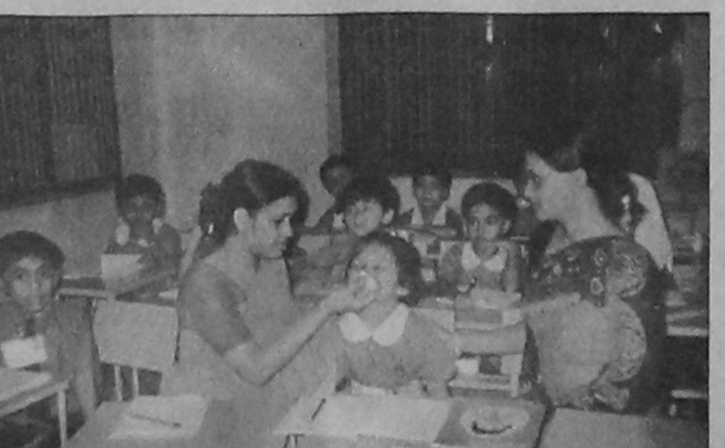
Students of Child Laboratory School being administered homeopathic vaccine against dengue at the school in Narayanjanj recently.