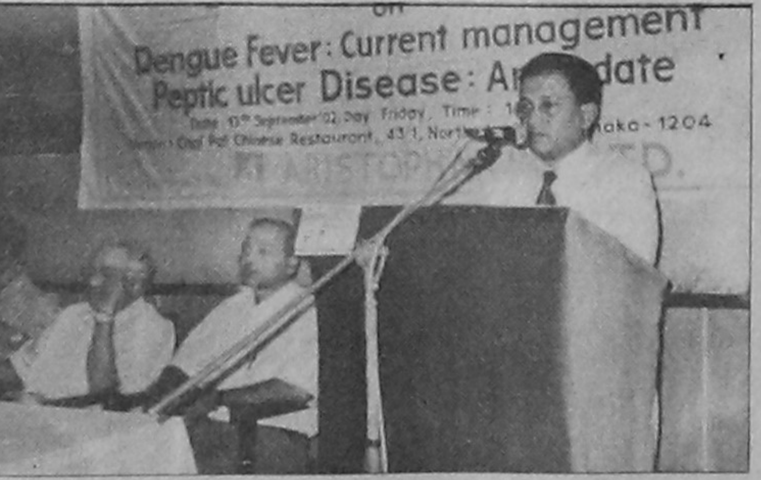
Aristopharma Ltd organised a scientific seminar on dengue fever and peptic ulcer disease at a city hotel yesterday.