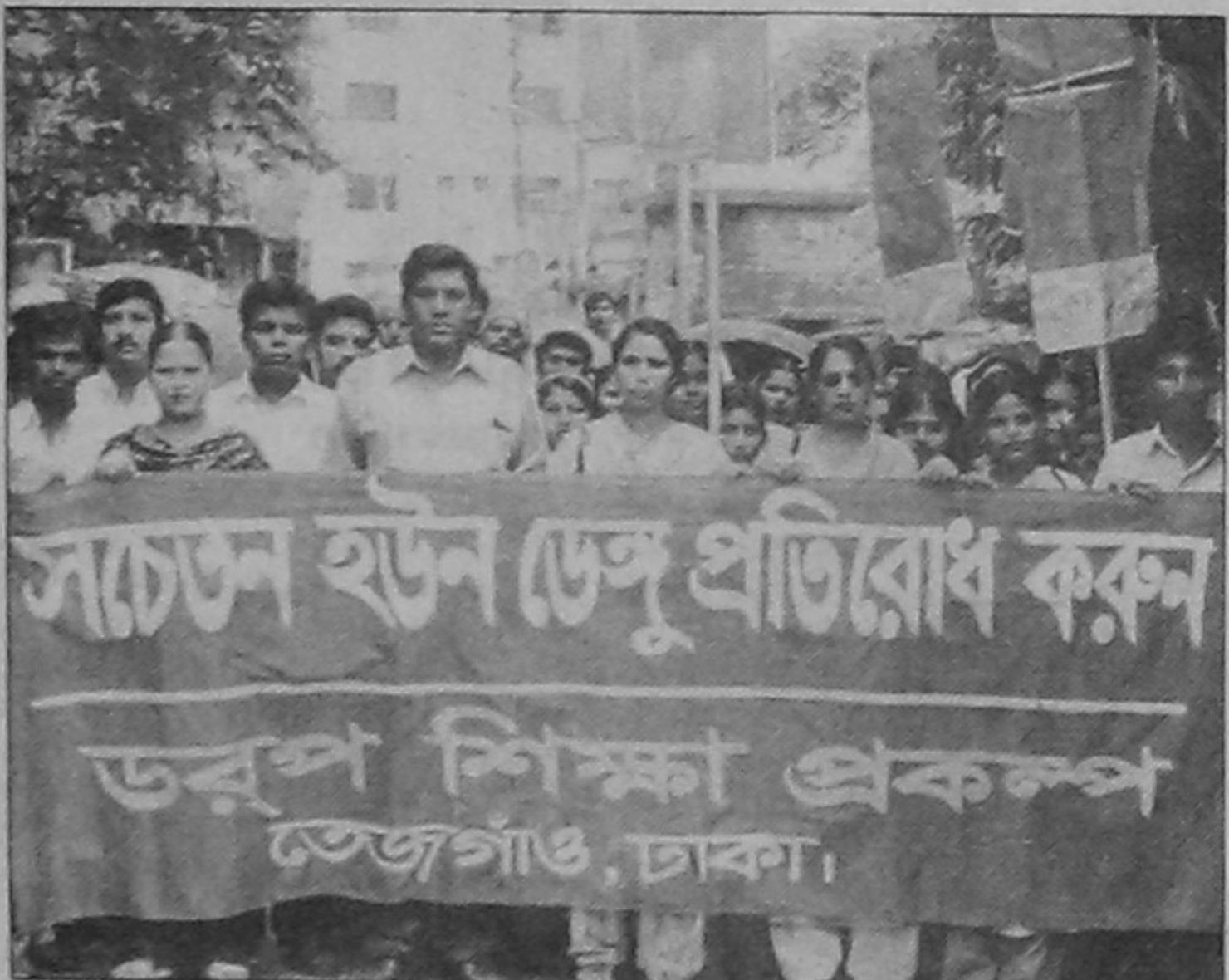
The DORP Education Project took out a procession in the city yesterday to raise awareness about dengue fever.