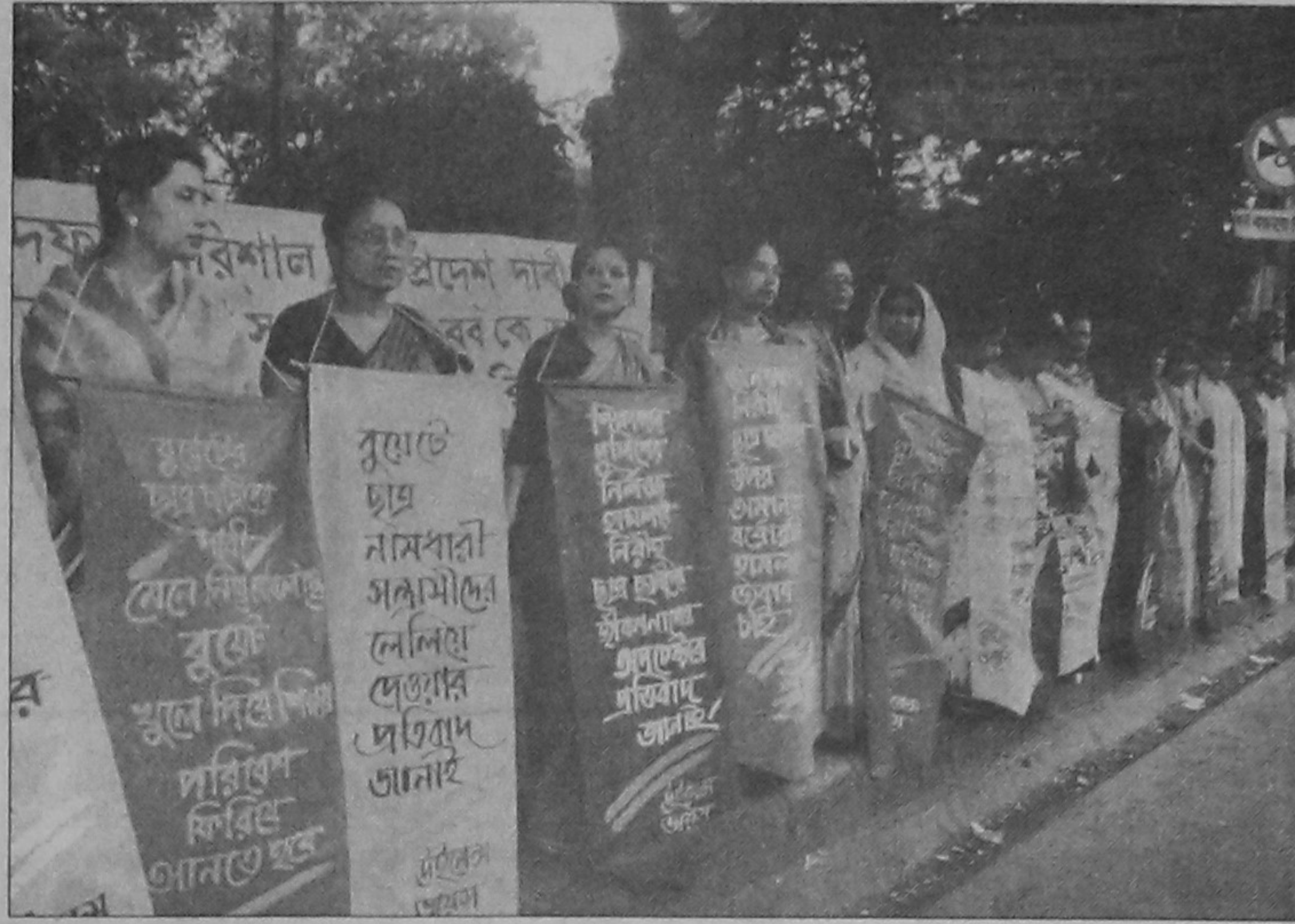
The Women's Voice formed a human chain in front of the National Press Club in the city yesterday protesting recent attacks on hunger-striking students of Bangladesh University of Engineering and Technology.

ganj thana, it has been alleged that a launch, Lucky, sank in the Kholmora launchghat under Keraniganj thana on July 31 this year.