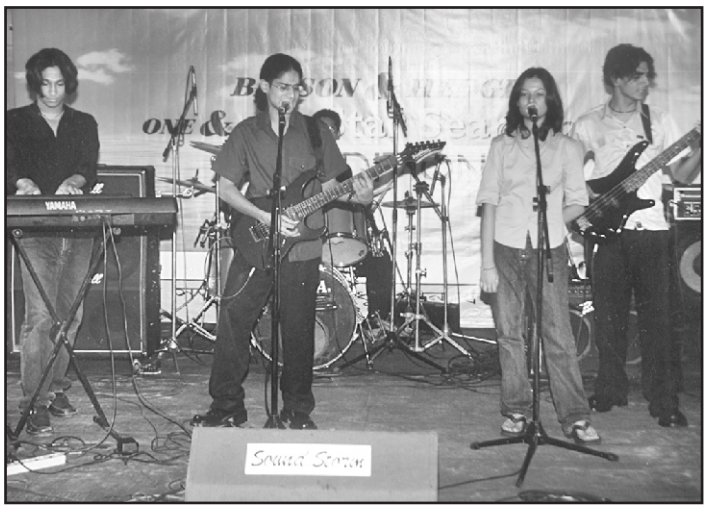
Subconscious from Dhaka

The program is scheduled to begin at 4:00 p.m.