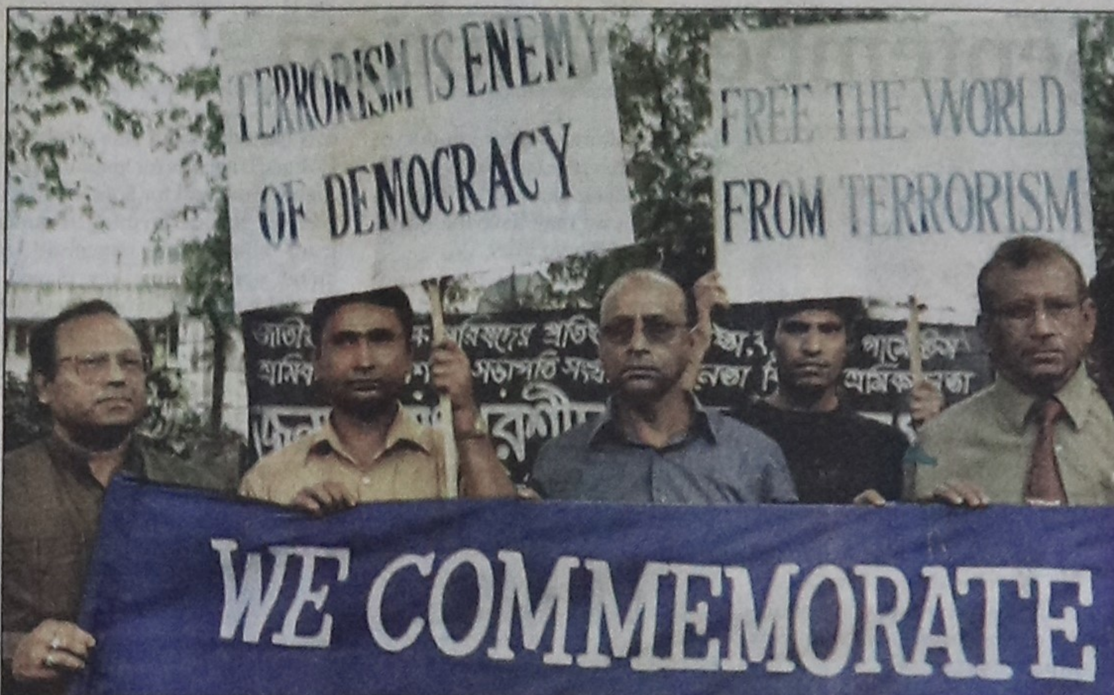
Expatriate Bangladeshis residing in the USA formed a human chain in front of the National Press Club in the city yesterday to commemorate the September 11.

They also condemned the recent attacks by the police and JCD and Shibir cadres on the students of Bangladesh University of Engineering and Technology (BUET), Dhaka University and Rajshahi University.