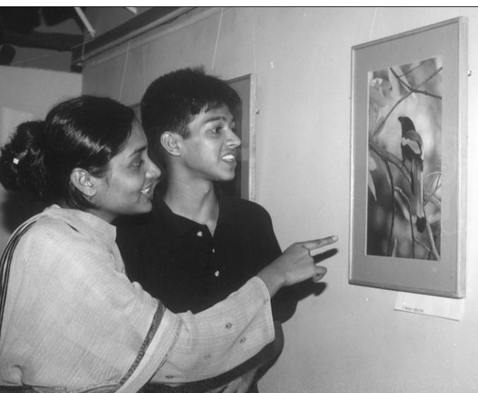
Visitors at the exhibition

Abdul Malik Babul's "Song of morning fog" shows a lot of people pushing carts loaded with green vegetables to be taken to the market to be sold. The men are wrapped in shawls and mufflers although their legs