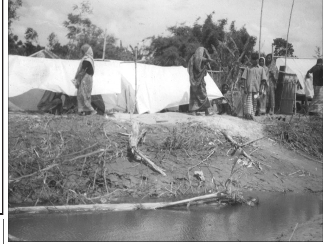
Erosion victims in Sirajganj have erected temporary makeshift structures on the Bangladesh Water Development Board (BWDB) embankment at Jechhara shoal.

In the meantime, many hadloom factories are under threat. District Relief and Rahibilitation office sources said houses of at least 5,500 families have been devoured by the Jamuna in the current seeson. The erosion affected upazilas are Kazpur, Sirajganj Sadar, Belkuchi, Chowhali and Shajadpur.