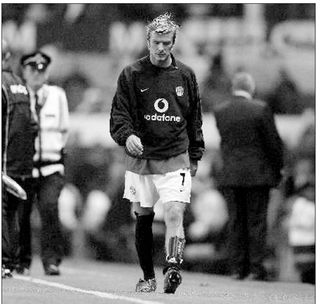
David Beckham, the Manchester United superstar, walks gingerly at the end of the game against Middlesbrough in the English Premiership at Old Trafford yesterday.