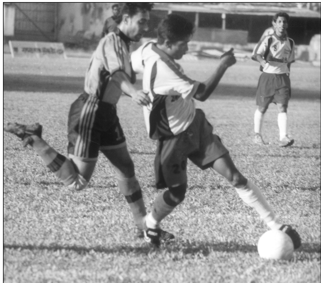
Action from yesterday's NBL Premier Division Football League match between Brothers Union and Dhanmondi Club.

"I will be speaking to the England management to see what the right course of action is."