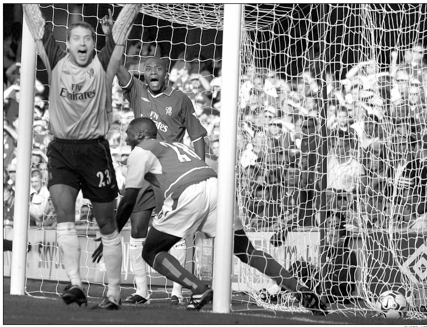
Arsenal's Ivory Coast recruit Kolo Toure (C) celebrates his goal as Chelsea custodian Carlo Cudicini (L) and defender William Gallas (R) pleads for an offside during their Premiership match at Stamford Bridge on September 1.

plagued by injury over the last three seasons, will have a medical on Monday before his official presentation as a Real player in the Santiago Bernabeu stadium at 1100 GMT. Relaxed and smiling on his arrival, and no longer sporting his World Cup hair cut -- he had shaved most of his hair off at the finals except for a small wedge-shape at the front of his head -- the 25-year-old was immediately ushered into a waiting car before he could speak to the assembled press. A convoy of five cars, escorted by members of the Spanish Civil Guard, then sped off to a restaurant in the foothills of the nearby Sierra Guadarrama where he lunched with Real sporting director Jorge Valdano and club president Florentino Perez. The player was then driven to the capital where he checked in to a hotel in the city centre where he will remain overnight. Real will pay the Italian club 35 million euros plus a player valued at between 10-12 million euros or a cash equivalent in order to acquire the services of the twice winner of the World Player of the Year award.