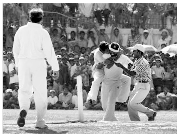
Two Tamil fans rush to hug their Sri Lankan bowling idol Muttiah Muralitharan during a friendly match in the northern city of Jaffna on Sunday.