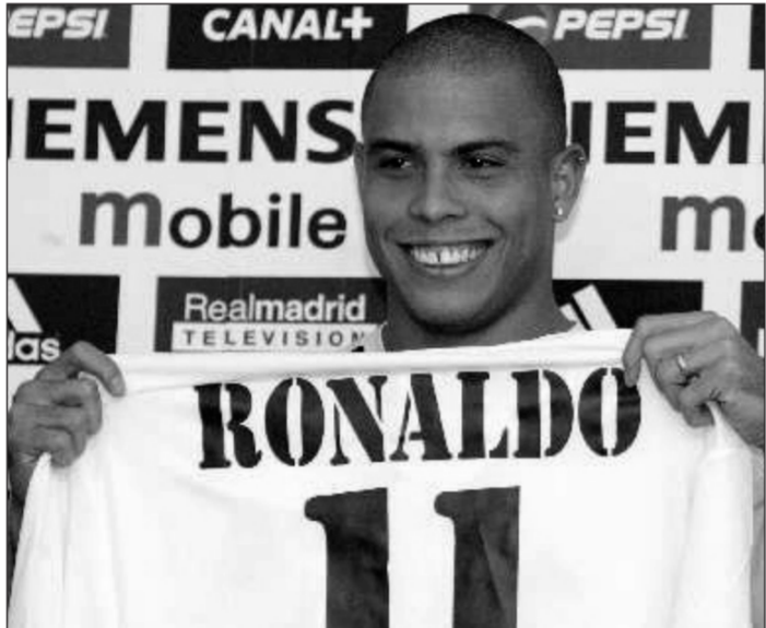
THE DREAM IS REAL: Brazilian superstar Ronaldo shows his new Real Madrid shirt during his presentation ceremony at the Santiago Bernabeu Stadium yesterday.

to thank come to R e a l M a d r i d president I hope to