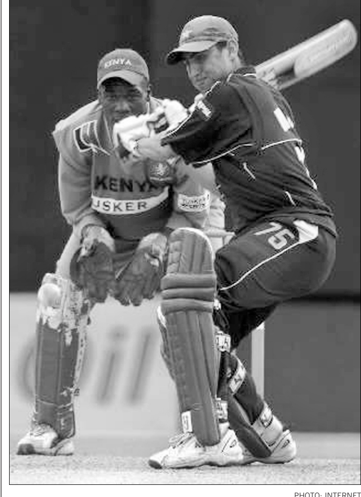
Pakistan's man-of-the-match Younis Khan gets ready to cut during his 87 not out against Kenya yesterday.