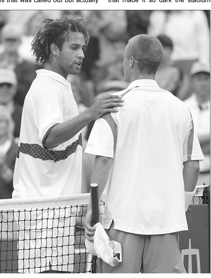
THERE'S ALWAYS NEXT TIME: American James Blake (L) congratulates world number one Lleyton Hewitt of Australia at the end of their epic third round match on August 31.

hit the line. Both players applauded great shots by the other, of which there were plenty: 113 winners, 60 by Blake, despite strong wind, occasional rain, and a cloud cover that made it so dark the stadium