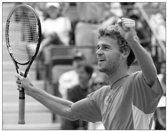
Brazilian Gustavo Kuerten is jubilant after beating Russian Marat Safin in the second round of the US Open in Flushing Meadows on August 30.