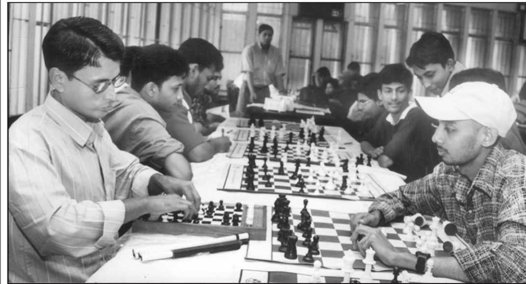
A visually impaired player makes his moves on a special chessboard while his opponent watches during their match in the Second Division Chess League at the NSC auditorium yesterday.

The Ashes squad is due to be announced on September 10.