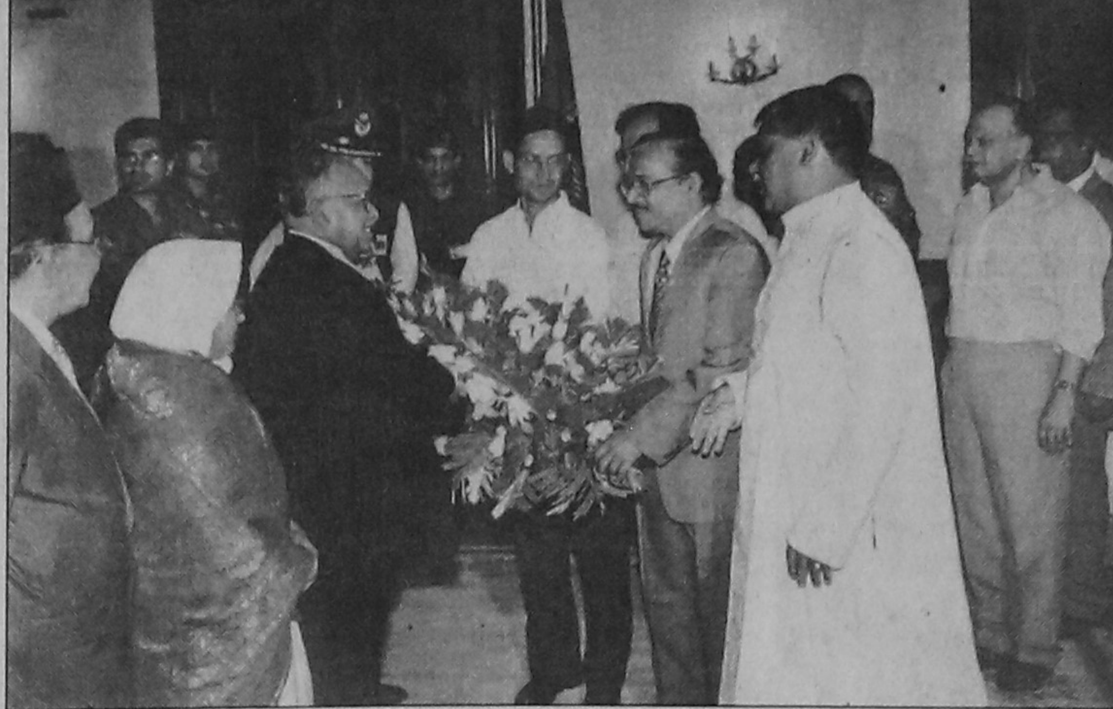
Acting President Jamiruddin Sircar exchanged greetings with members of the Hindu community on the occasion of Janmastomi at Bangabhaban in the city yesterday.